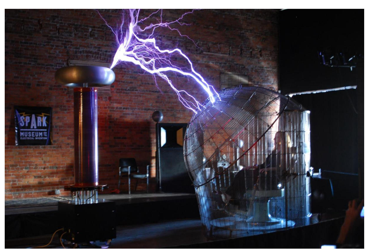
MegaZapper and Faraday Cage at the Spark Museum of Electrical Invention in Bellingham.