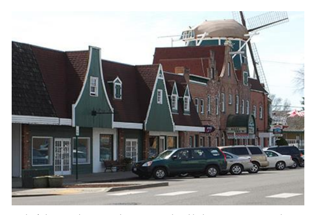
Lynden's historic downtown has new retail and lodging opportunities that serve the entire county.