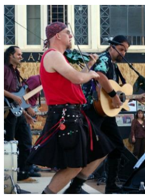
Downtown Sounds concert series in Bellingham's Arts District.