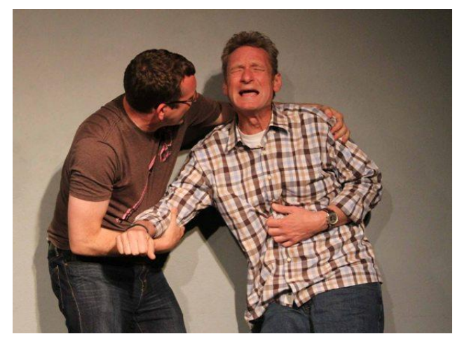
Bellingham's Upfront Theatre is an all-ages cabaret style venue that offers live improv comedy every Thursday, Friday, and Saturday night.

The following Strengths, Weaknesses, Opportunities and Threats (SWOT) were identified through individual conversations with stakeholders, on-line survey, and during a stakeholder meeting on April 28<sup>th</sup>. The SWOT analysis was used by the group to provide a baseline from which to build the Strategic Plan ,