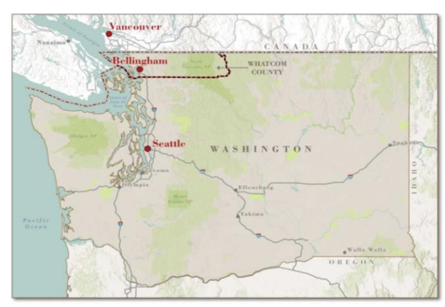
Map of Whatcom County within Washington State.

The Salish Sea is one of the world's largest and most biologically rich inland waters, which the Coast Salish people traditionally navigated by cedar canoe. Whatcom County remains the home of the Lummi and Nooksack Tribes, both of which have maintained their traditional and contemporary culture. Salmon fishing is an historic industry in Bellingham and Blaine, both