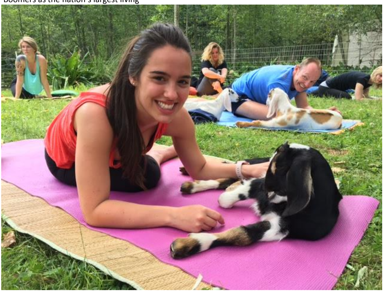
Small farm operations like the Goat Boat Farm near Wickersham offer locally produced food as well as unique experiences such as Goat Yoga, popular across all generations.

http://www.destinationbc.ca/getattachment/Research/Research-by-Activity/All-Sector-Profiles/Aboriginal-Cultural-Tourism-Sector-