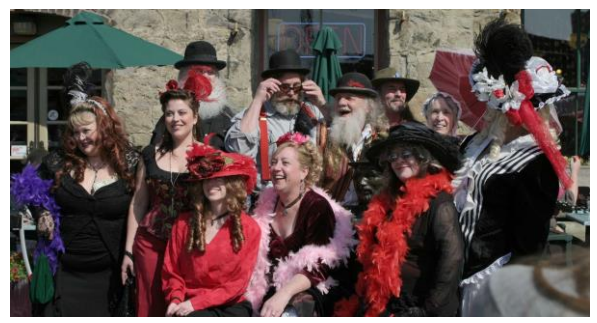
Historic Fairhaven's annual Dirty Dan Days festival