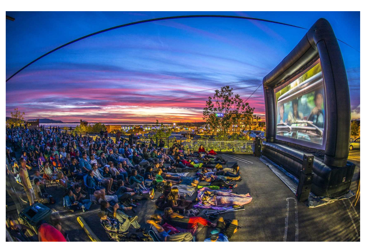
Pickford Film Center offers outdoor cinema during the summer on downtown Bellingham Parking Garage roof.

Research indicates that people staying in commercial lodging (hotels, motels, B&Bs, vacation rentals) account for slightly over 60% of all visitor spending.