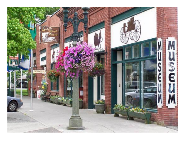
Cross-marketing historic museums such as the Lynden Pioneer Museum help promote longer stays.