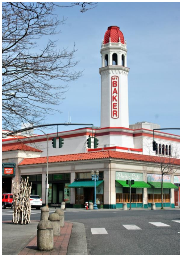
Mt. Baker Theater in Bellingham's Downtown Arts District.

Increasing seasonality and improving local assets could expand Bellingham and Whatcom County's tourism growth.