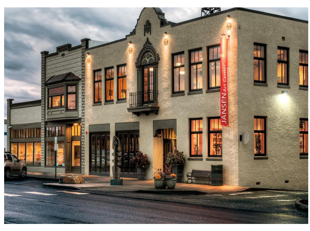
The Jansen Art Center in downtown Lynden is a cultural asset that serves residents, visitors and tourists county-wide.