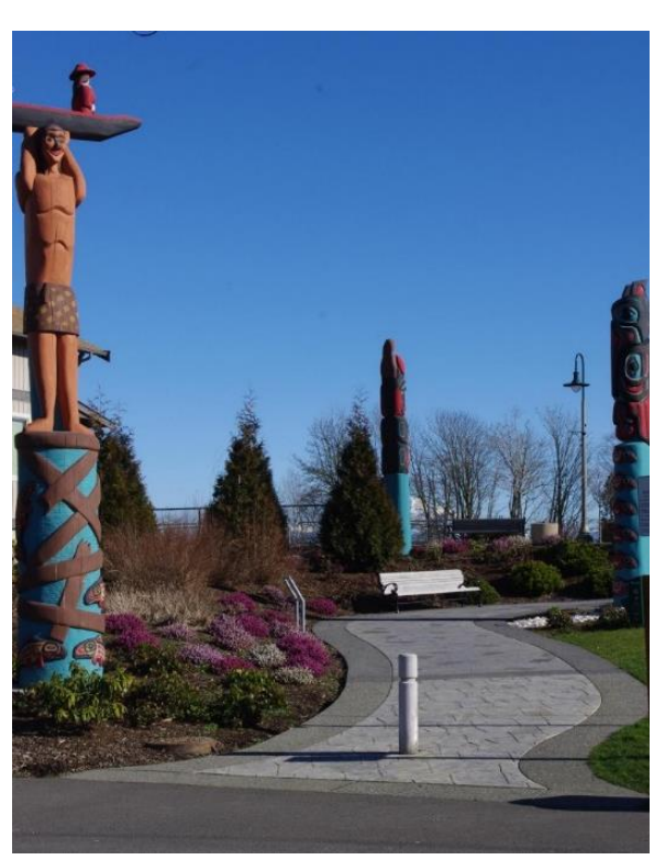
Lummi story poles along the Ferndale River Walk are a contemporary art form, and draw interest from visitors and residents.