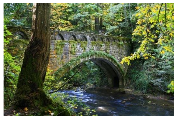
The historic Civilian Conservation Corp bridge in Bellingham's Whatcom Falls Park.