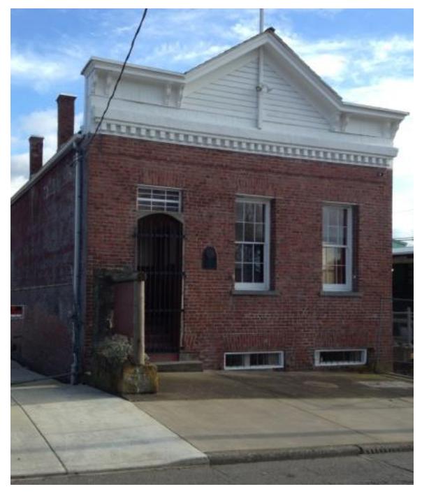
The Territorial Courthouse in Bellingham's Old Town is the oldest brick building in Washington State.