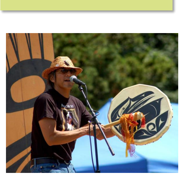
The Lummi and Nooksack Tribes hold some events that are open to the public.