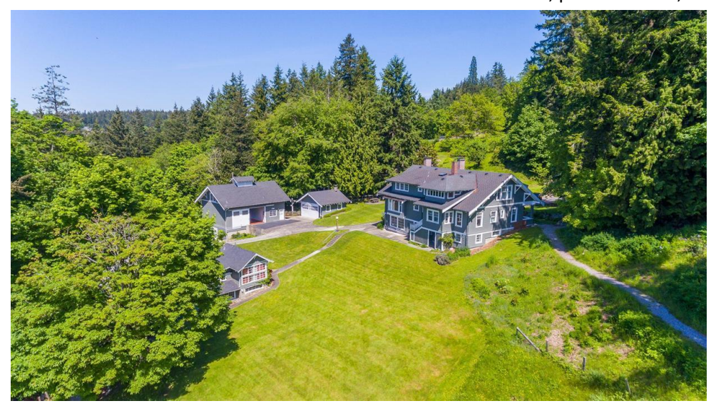
Bellingham's historic Woodstock Farm has become a popular wedding venue, and would benefit from additional programing, interpretation and access.

Foodies thrive in Bellingham and Whatcom County. The fertile farmland of the Nooksack Valley, surrounding the communities of Lynden, Sumas, Everson and Ferndale, produces more than 60% of the U.S. red raspberry crop and is a major supplier of dairy products