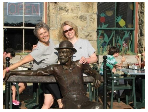
Historic\ Fairhaven\ in\ South\ Bellingham\ and\ Downtown\ would\ benefit\ from\ cross-marketing.\ (City\ of\ Bellingham\ photos\ above\ and\ below.)