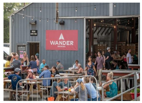
Bellingham and Whatcom County have a growing craft beer culture that draws visitors of all ages and interests throughout the year.