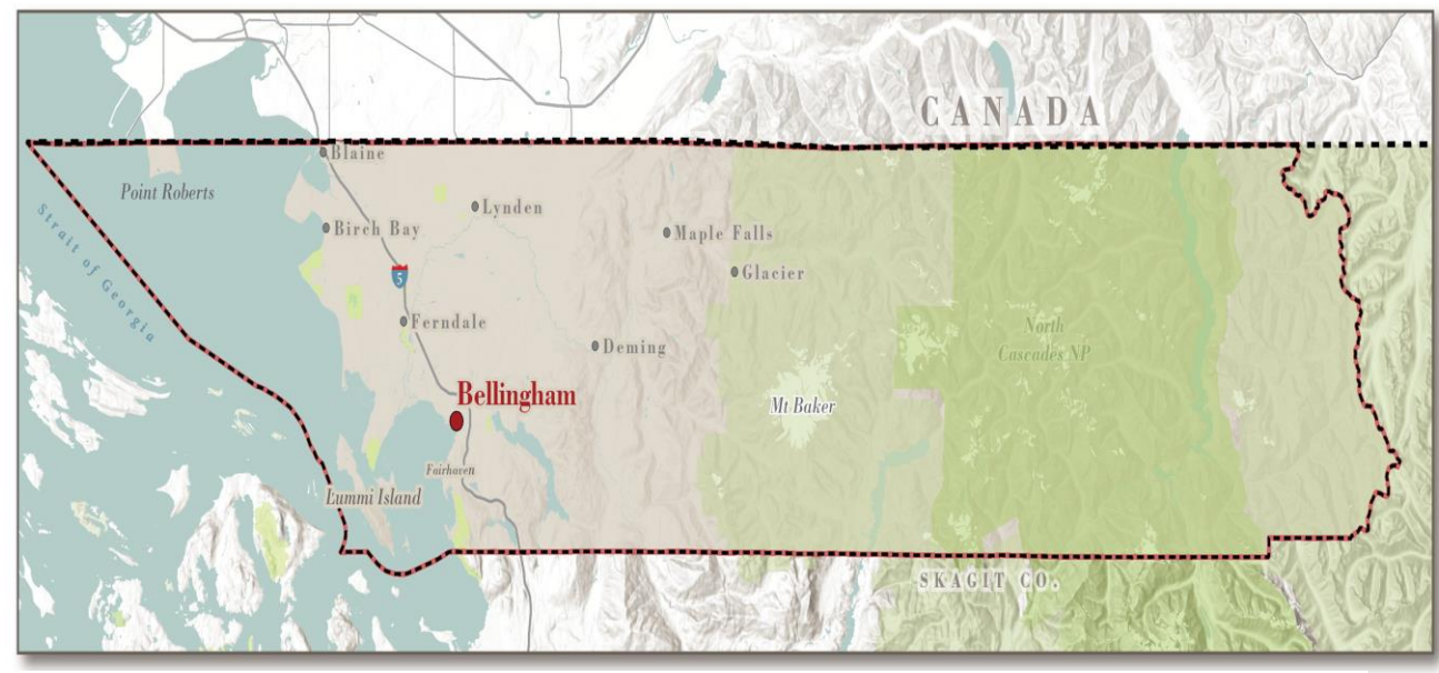
Map of Whatcom County, Washington.