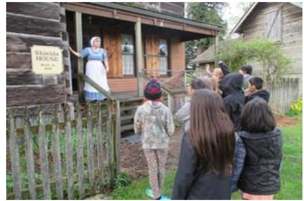
Ferndale's Pioneer Park.