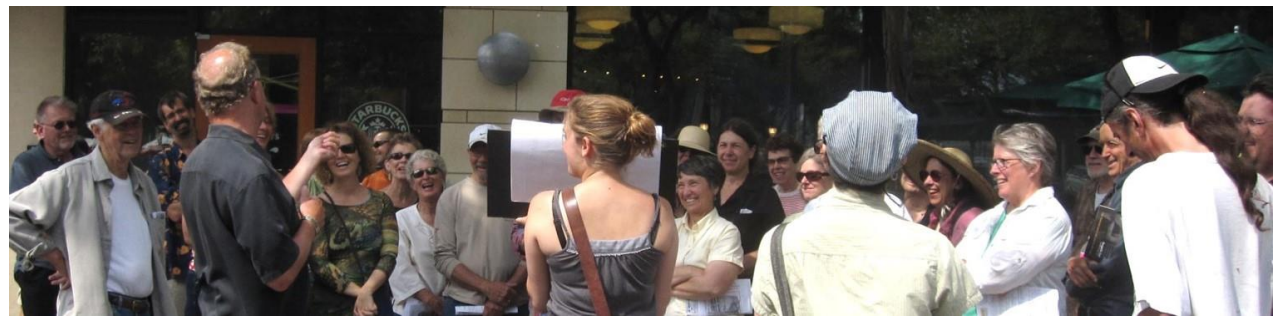
Guided historical tours are popular with both visitors and residents.