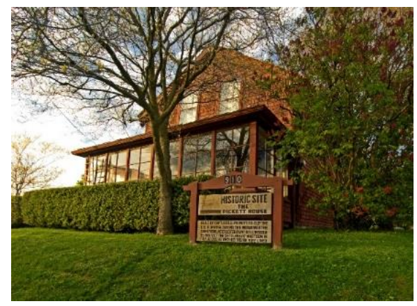
The historic Pickett House in Bellingham's Old Town.

And cultural heritage tourism is not limited to domestic U.S. travelers. International travelers are also interested in U.S. cultural heritage. According to the 2015 Cultural Heritage