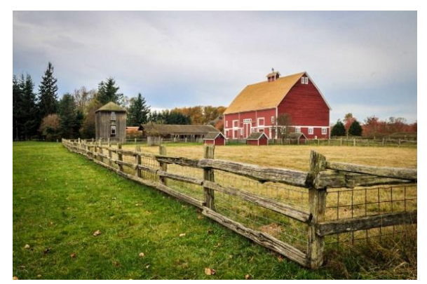
Hovander historic homestead, a county park in Ferndale hosts festivals and other events.

The planning process included forming a Core Planning Committee and Advisory Stakeholder Group, compiling a countywide Cultural Heritage Tourism Asset Inventory, conducting a "visitor-readiness" assessment of current cultural heritage tourism experiences and venues, and analyzing the county's strengths, weaknesses, opportunities and threats. Competitive destinations – Asheville, North Carolina; Bend, Oregon; the San Juan Islands and Yakima Valley, Washington - were assessed as to their similar products and promotions. The findings from the Competative Analysis determined that Bellingham and Whatcom County have great potential to attract multiple audiences – the Cultural Heritage Tourist; Regional Tourists (particularly the Seattle -Vancouver, B.C. market); and the Generational Market (Millennials, Generation Xs, and Baby Boomers) – to enhance the county's destination brand and increase the annual economic impact from tourism.