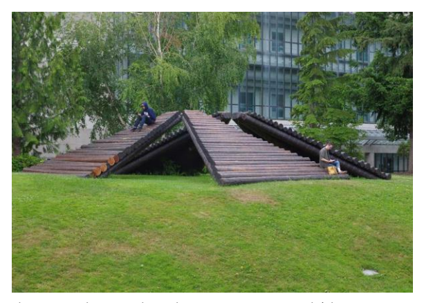
The WWU sculpture garden welcomes visitors year round.