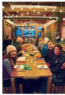
North Cascades Institute hosts an October feast featuring the bounty of the local harvest.