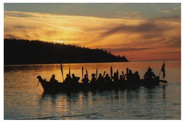
The annual Stommish Festival on Bellingham Bay is a Lummi traditional event that welcomes all.