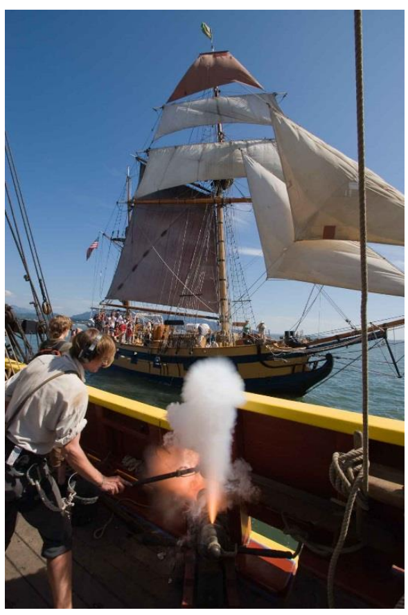
History comes alive when Tall Ship Lady Washington docks during the summer months in Bellingham Bay and Blaine's Drayton Harbor.