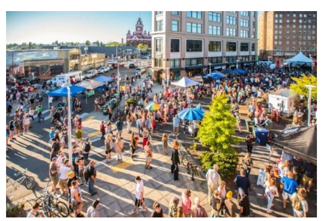
Downtown Sounds bring all ages into Downtown Bellingham's Arts District during the month of July.

To enhance the economic and social prosperity of Bellingham and Whatcom County by promoting and delivering quality cultural heritage experiences to tourists, while respecting and protecting the county's unique and diverse ecosystems, environments, history, lifestyles and cultures.