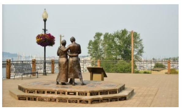
Public art in Blaine on the boardwalk.