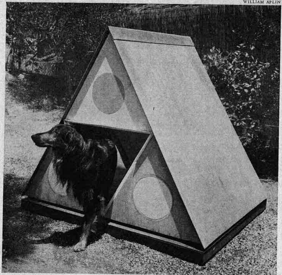
Doghouse of modern design is painted to match the owner's Los Angeles house. A divided canvas door lets the dog squeeze in and out, yet keeps out the wind