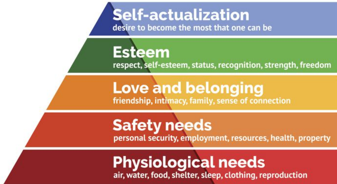
Maslow's hierarchy of needs