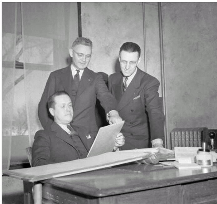
A well-framed motion is clear and easy for all to understand.

By presenting a clear and concise motion based on your community’s design guidelines, you are better able to inform the public as to why you are approving, approving with conditions or denying a Certificate of Appropriateness and avoid misunderstandings and ill-feelings towards the commission and your community’s preservation agenda.