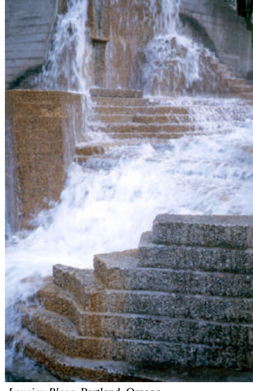
Lovejoy Plaza, Portland, Oregon

Beginning with the wide-open stepped concrete plaza at Lovejoy , the visitor is brought into Halprin's vision of the rocks of the High Sierra, where the board-formed steps echo the ledges of rocks recorded during Halprin's hikes for inspiration. The fountain is successful in developing a variety of vistas and water modifiers, that is to say, ways to make the water perform in both active and contemplative manners. The large open areas and the accompanying wooden wing-like structure, de-