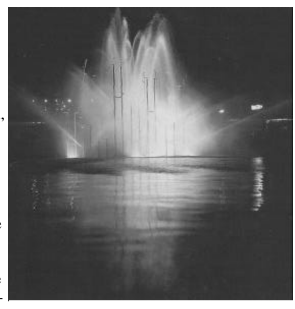
Water Fountain by Lawrence Halprin, Seattle Center, (1962, now demolished)

Lawrence Halprin first became involved with the development of the East Capitol Campus in January, 1967 when he was placed under contract as landscape architect to develop patterns for land-