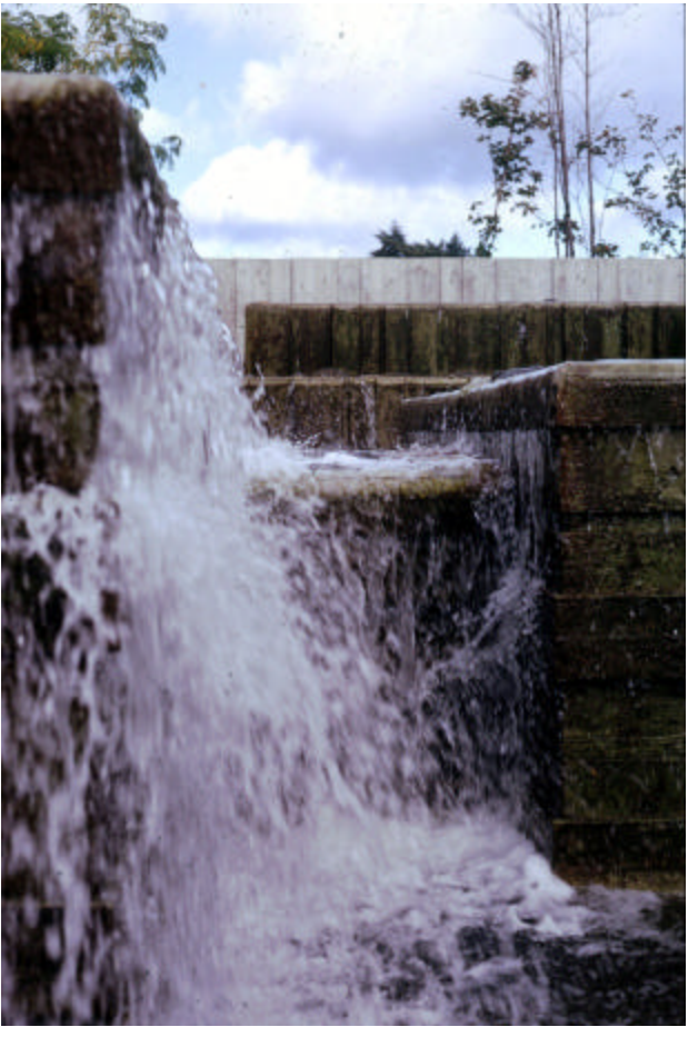
Water Garden, 1972