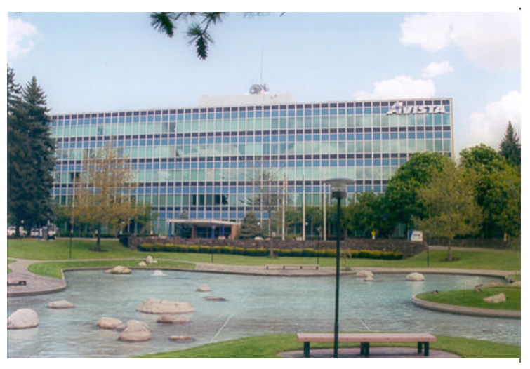
Washington Water Power campus (1959)

It is of concern that in WAC 236-18-040 (3) it states, "the original artist or designer holds no rights to any work commissioned, donated, or purchased for display on state capitol grounds, including reproduction, access, modification relocation resale, etc., unless such rights are specifically allowed in formal written agreement between the director and the artist. The state reserves the right to relocate or remove works. Relocation will include consultation with the original artist or interested parties whe never practical."