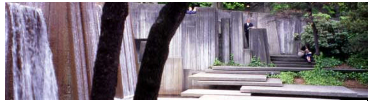
Ira A. Keller Auditorium Forecourt Fountain, Portland, Oregon

signed by architect Charles Moore, invite the public's participation. Indeed, many weddings and ceremonies have been performed here. The sound of the water pervades the area.