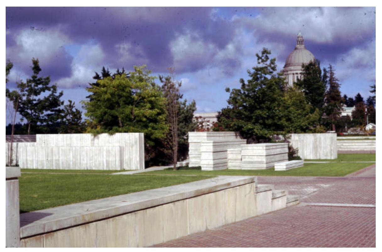
Water Garden, 1972