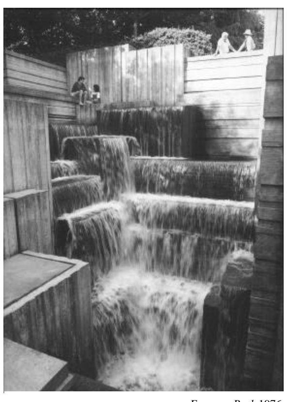
Freeway Park 1976

The smaller Water Garden uses elements from the previous three but with some additions and deletions. The Water Garden uses jets of water to break the surface of the water. The nozzles of the vertical jets are positioned slightly below the apparent water level, directing the water up between the two adjacent plinths, thus creating