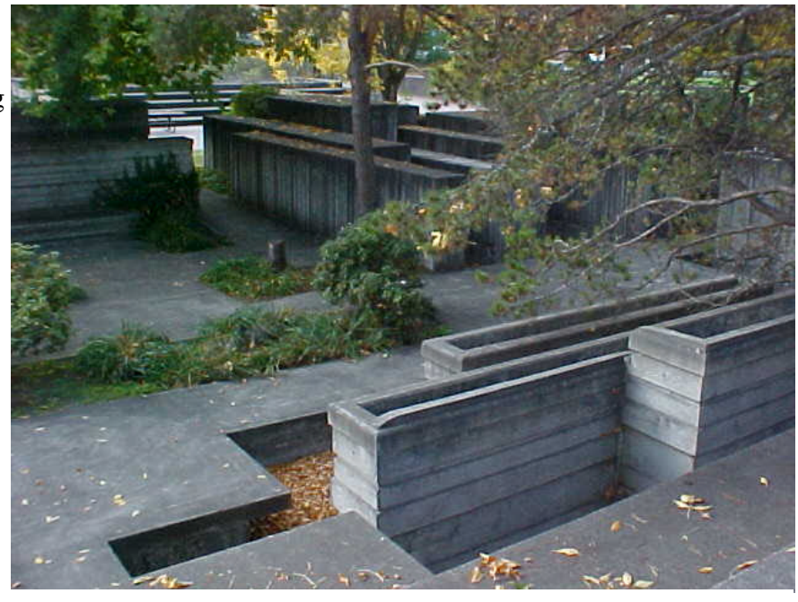
Water Garden, 2004

As Water Garden has had almost continual water loss problems, with the resulting maintenance shut-offs until it was permanently turned off in 1992, it is valuable to compare it as a static, dry work to other sculpture of the period. Even when it was operational, there was no water flowing between October to April for season shut-offs. The state of the work is not optimal. The plantings are fully mature and actually beginning to encroach upon the concrete forms. There are stumps of trees cut down