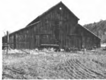
Old Starr Farm Barn (1859), Columbia County