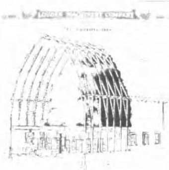
Louden Machinery Company illustration of the superstructure of a gambrel roof plank frame barn (1915:11)