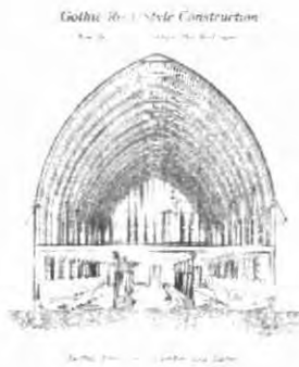
Illustration of Gothic roof (or arch roof) style construction, Gordon Van Tine Company (1917:25)