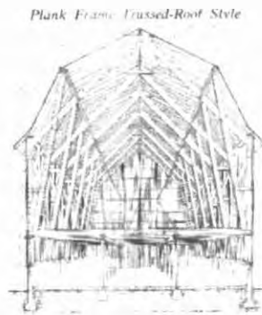
Illustration of plank frame trussed-roof style gambrel barn, Gordon Van Tine Company (1917:23)