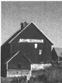
Beck-Walker Barn (c.1890), Spokane County