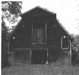
Wilkinson Barn (1914), Pierce County