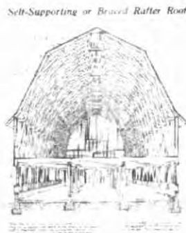
Illustration of self-supporting or braced rafter roof style gambrel barn, Gordon Van Tine Company (1917:24)