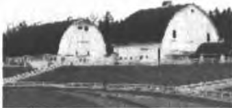
Kelsey Creek Farm Barns (1933/1943), King County