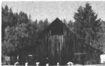
Canter-Berry Farm Barn (1879), King County