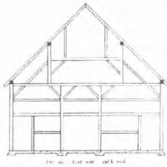
End bent of a gable roof timber frame barn, from Ekblaw (1914:219)