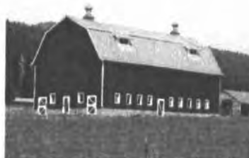
Dubois Barn, Stevens County