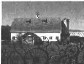
Dalhmen Barn (1935), Whitman County