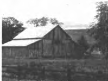
Milton & Newton Aldrich Barn (1864), Walla Walla County