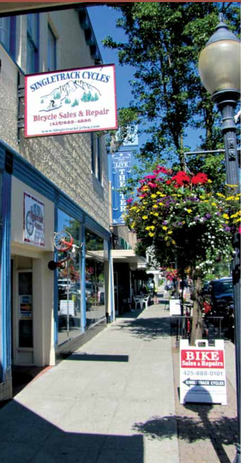
North Bend Historic Commercial District (1910-1960)