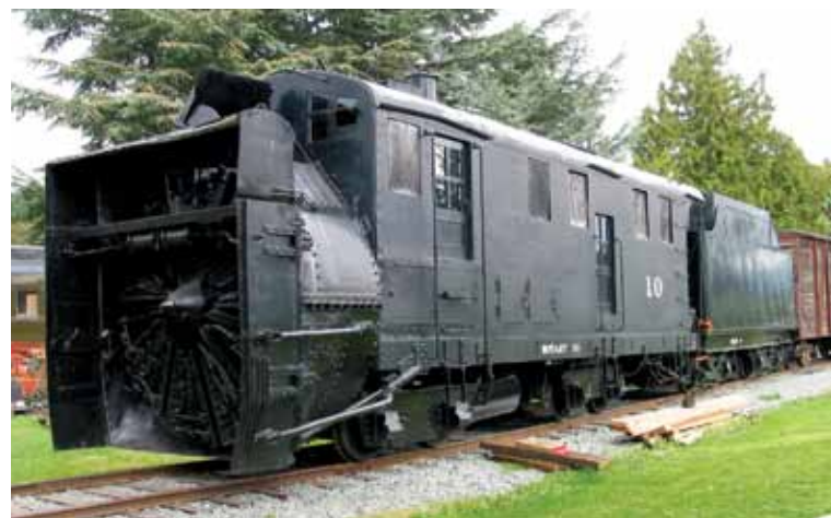
Alco/Cooke Railroad Snowplow (1907), NW Railway Museum, Snoqualmie

Partnering with local communities is desirable for many reasons, including but not limited to informing local residents about the preservation process, giving ownership of the project and products to the community, expanding the amount and type of information that might otherwise be collected, expediting the research process and so forth. The HPP's survey projects are often conducted in cooperation with others but this can be expanded and other projects, such as development of context statements, can also be conducted in partnership.