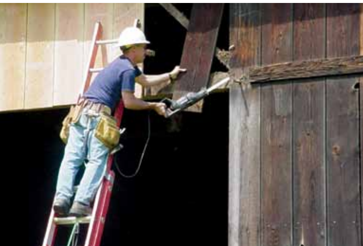
Barn rehabilitation, Mary Olson Farm (1897), Auburn

The plan's 43 actions detail how the objectives will be accomplished over the plan's time frame. Actions are listed in rough priority order and may apply to multiple objectives but are described in relation to their primary objective.