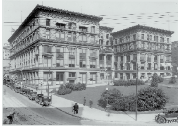
King County Courthouse (1916), view c. 1920, Seattle

Several county agencies own and manage landmarks and eligible historic properties. The Department of Permitting and Environmental Review is responsible for conditioning and approving private development projects in the unincorporated area.