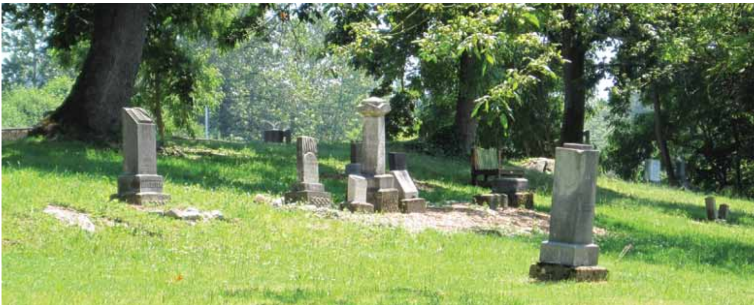
Saar Pioneer Cemetery (1873), Kent

Department of Transportation Act, Section 4(f) (49 USC 303). “It is...the policy of the United States Government that special effort should be made to preserve... historic sites.” “The Secretary may approve a transportation program or project... requiring the use of...land of an historic site of national, State, or local significance... only if (1) there is no prudent and feasible alternative to using that land; and (2) the program or project includes all possible planning to minimize harm to the...historic site resulting from the use.”