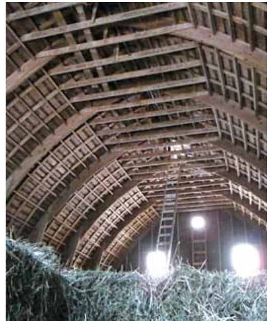
Hay loft, Adair Barn (1922), Snoqualmie Valley

The HPP has adopted some new technologies in its operations including digital photography, electronic databases, GIS (geographic information systems) software and other tools that improve analysis and efficiencies. However, field work and offline research could be made more efficient and effective by using new tools such as digital tablets in the field for database input and photography, related systems for research data collection, and automated data harvesting from the Assessor’s Office and elsewhere.