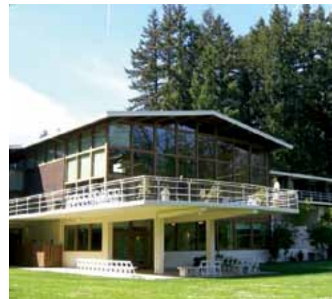
Top: North Bend Theater (1941)