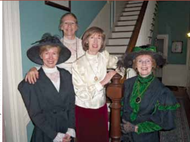
Neely Mansion (1894), Volunteers in period costume, Auburn vicinity