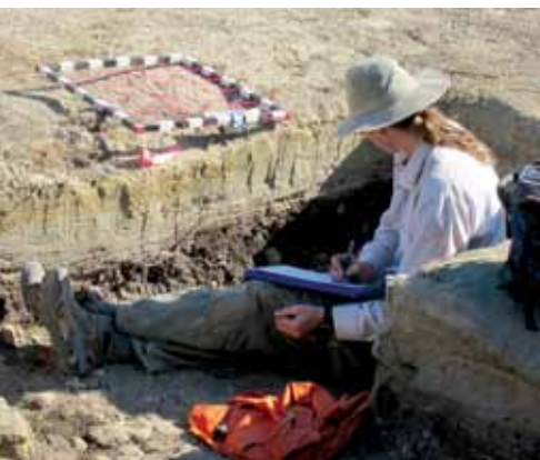
Excavation at Bear Creek archaeological site (at least 10,000 years old), Redmond

The HPP provides landmark owners and stewards with information about available incentives, the design review process and advice on caretaking for historic building materials and features of properties. The HPP's web site, currently being updated, provides information on Landmark Commission meetings and other current activities, the history and significance of landmarks, historic themes and a range of "how to" information in a series of technical papers. Technical papers are also made available in an adapted form for distribution by contract cities receiving preservation services. The HPP also provides training opportunities, direct technical assistance, and conducts public events that inform and support owners of historic and archaeological properties.