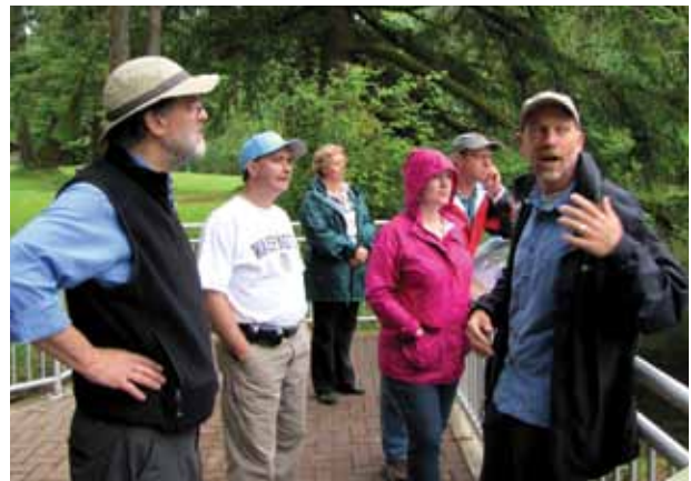
Commission and staff touring Cedar River Watershed

County and city agency staff whose work affects historic and archaeological resources – planners, permitting staff, public works staff and others – may not be well informed about historic