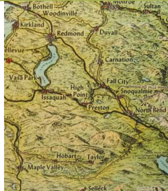
Historic map of King County (no date)

Today the HPP is supported primarily by the HPPH Fund. Other revenues supplement the HPPH Fund monies, including fees for services provided to cities and other governmental agencies, and state and federal grants. Because the HPP’s funding and programmatic responsibilities have changed significantly over the last decade, it is critical to update the Strategic Plan to identify new and strengthen existing funding sources and to coordinate them more directly with programmatic priorities.