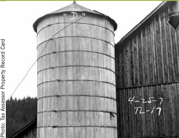
Barn and wooden silo (no date), Snoqualmie Valley