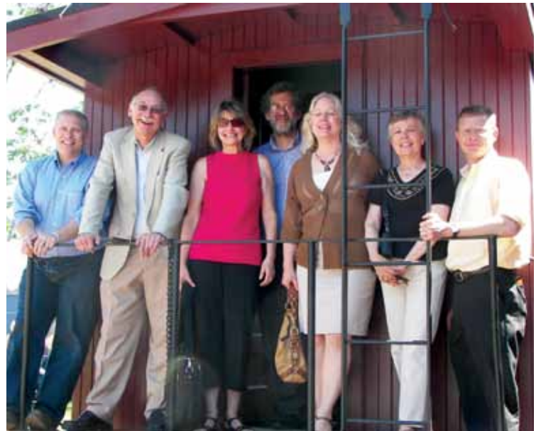
Landmark Commission members with Historic Preservation Program Staff, Snoqualmie Depot

The King County Historic Preservation Program was established in 1978 to identify, document, and protect significant historic resources. Two years later the Landmarks Ordinance was adopted; it established a 9-person Landmarks Commission and a process for designating and protecting historic resources. The ordinance also called for maintaining an inventory of historic resources, developing incentives to support and encourage restoration and rehabilitation, and working cooperatively with other jurisdictions to protect significant historic resources.