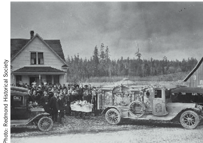
Top: Indian woman on Seattle waterfront (1898)