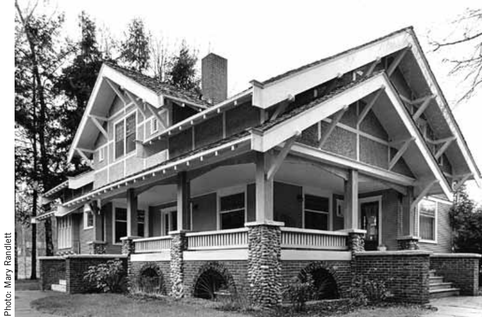
Helmer and Selma Steen House (1909), Vashon Island

Priorities for landmark designation are typically determined at the completion of a survey and inventory project and nominations often follow directly from these projects; usually because a property owner wants to take advantage of the incentives that are available to landmark stewards.