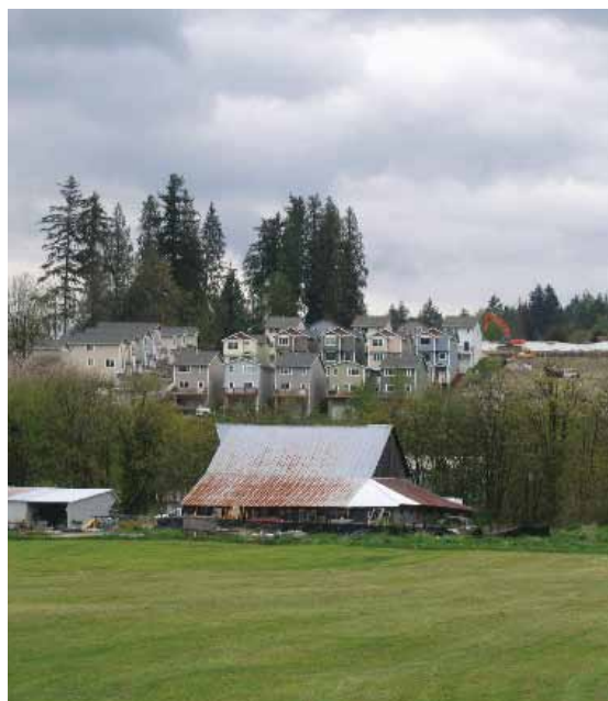
New residential development, Duvall

Regional Growth Centers, located in Seattle and most of the suburban cities, have been identified by the Puget Sound Regional Council for concentrating housing and employment growth. The growth centers are expected to see the majority of the population increase in the near future, and almost all growth is expected to occur within urban growth areas. The growth centers often overlap with historic commercial centers and are