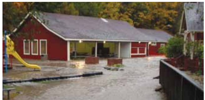
Covenant Beach Camp (1917-1957), 2006 flood, Des Moines

Hasty red tagging and quick demolitions of historic