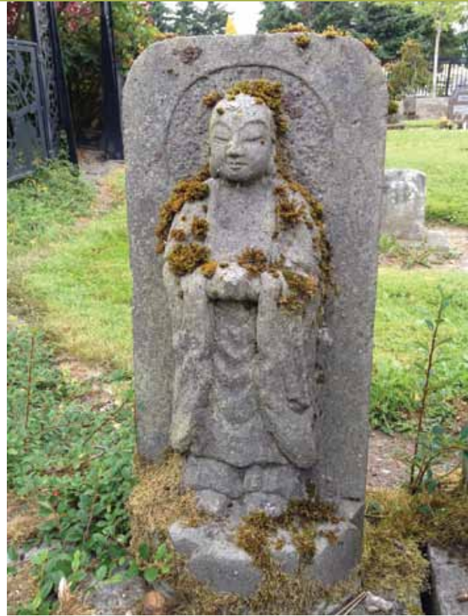
Jizuo Statue (Buddhist), Auburn Pioneer Cemetery (c. 1920)