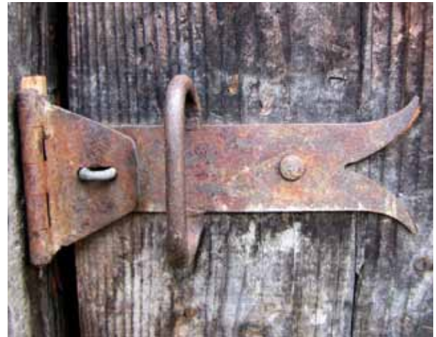
Fall City Hop Shed hasp (c. 1888)