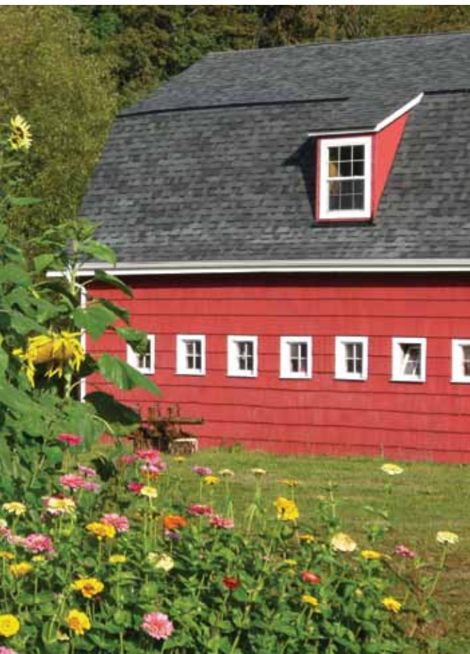
Serres Barn (1933), Happy Valley