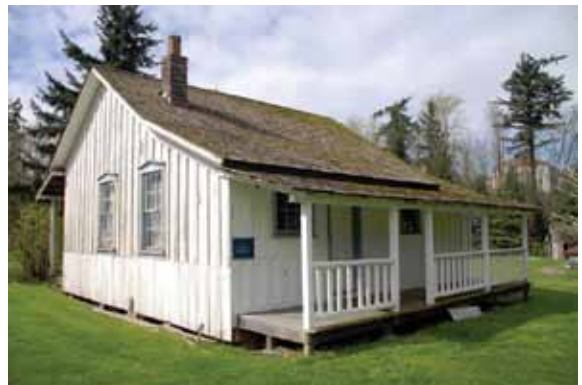
Pacific Coast Coal Company House (c. 1880), Newcastle