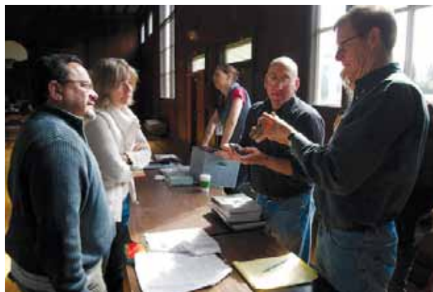
Identifying archaeological artifacts, Burien

Workshops and public events are typically oriented to specific initiatives (cemetery marker restoration, etc.). Public meetings are also done in conjunction with survey and inventory projects; archaeological artifact identification workshops are conducted regularly in partnership with the Burke Museum. Training for landmark commissioners and city staff is done as needed. The HPP is also providing training for county staff as part of implementing the new Executive Procedures for Treatment of Cultural Resources .