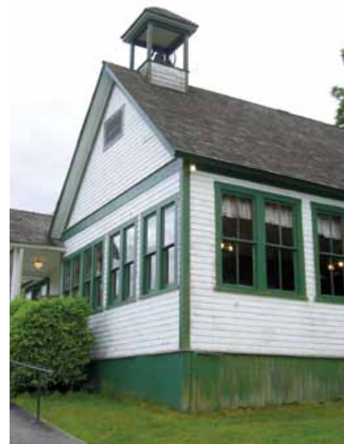
Vincent Schoolhouse (1905), Snoqualmie Valley

This plan provides for tracking and monitoring at two levels: objectives and actions. The following table provides more detail on the types of information that will be used for performance assessment.