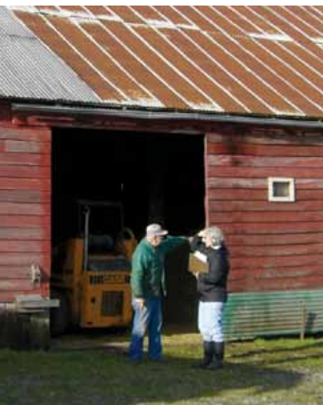
Barn survey, Enumclaw Plateau

The HPP's regional focus is rare and, in some respects, unique in Washington state. Spokane's county and city programs are combined, as are Clark County's program and that of the City of Vancouver. The HPP serves a larger area and population than either the Spokane or Clark County programs and provides a broader range of services to more cities.