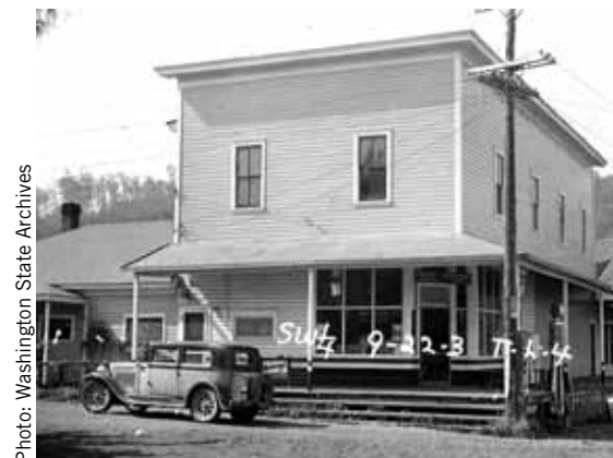
Portage Store & Post Office (1910), view in 1937, Vashon Island

Environmental sustainability and conservation of the natural environment seek many of the same ends and share many values with historic preservation. Intended outcome: Preservation is