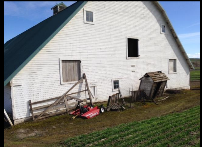
Donovan Farm, Prescott – 1915