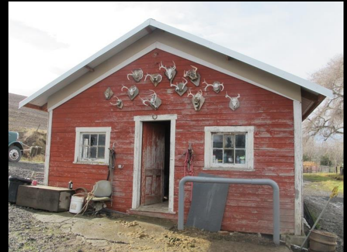
Hickman Farm, Colfax – 1905