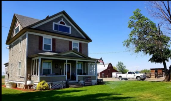
H.L. Lawrence Ranch, Zillah – c.1915