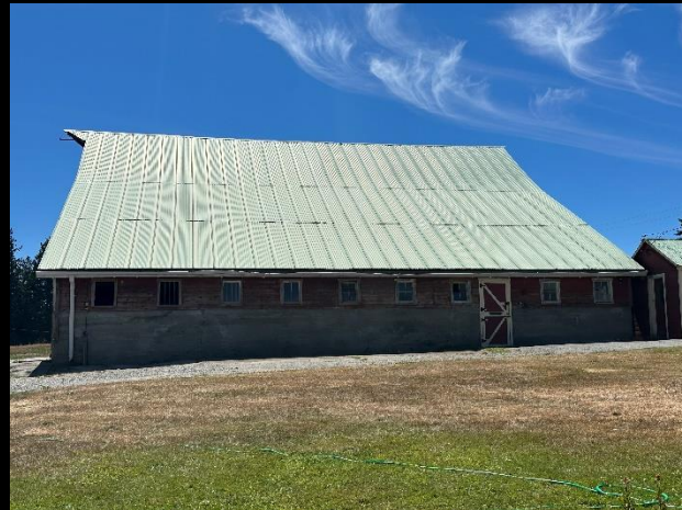
Ole Egesten Farm, Stanwood – 1940