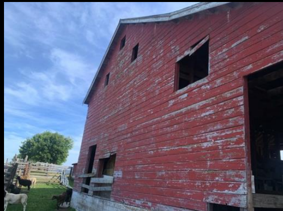
Dutchman's Farm, Deer Park – 1951