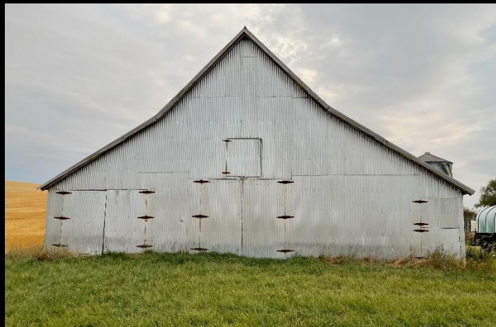
E.C. Rohweder Barn, Spangle – c.1890