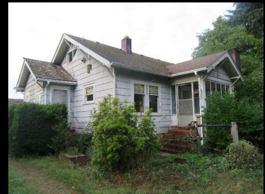
Harris-Ames Farmstead, Olympia – 1931