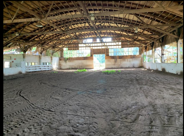
Big Chief Arena, Olympia – 1958