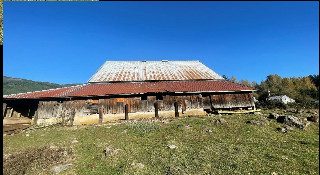
Ransweiler Farm, Ashford – c.1895