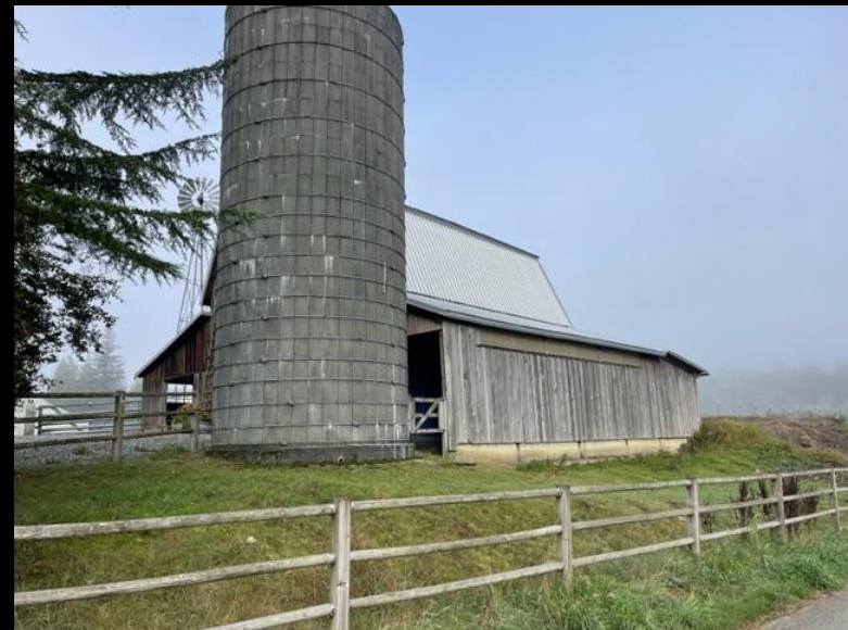
Chase - Inthavongsy Barn, Sultan – 1901