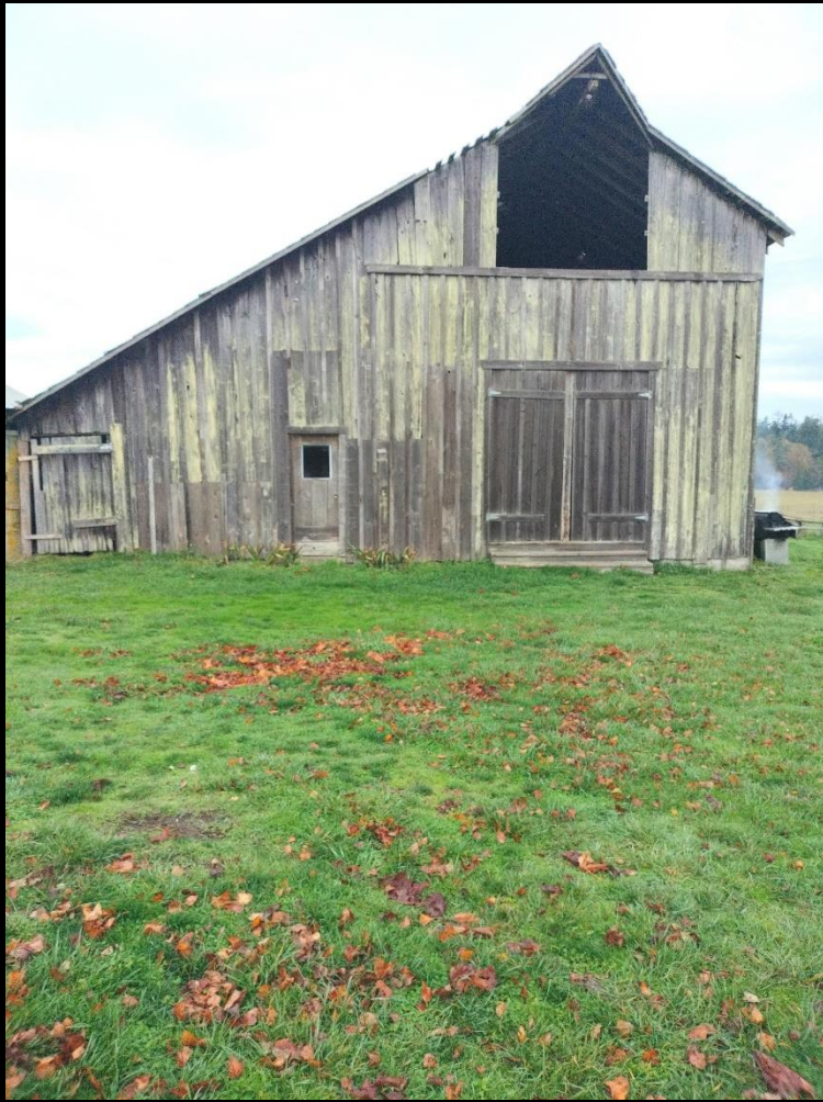
Boyce Homestead, Friday Harbor – 1928