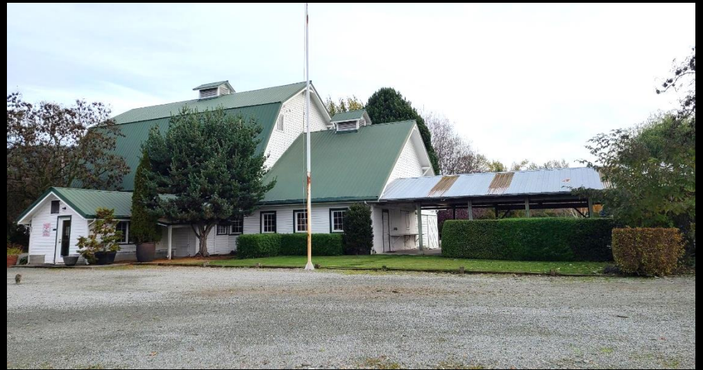
Suikland - Burkland Farm, Mount Vernon – 1920