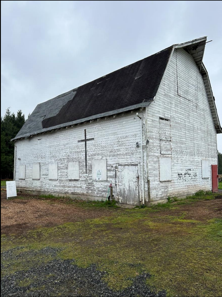
Stevenson - Wilcox Barn, Marysville – 1928