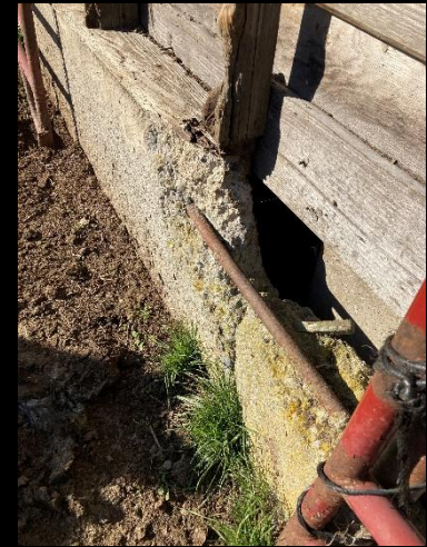
Woods Farm, Onalaska – 1951