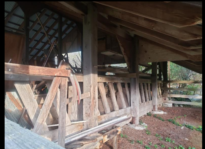
McDonald Farm, Olga – 1940