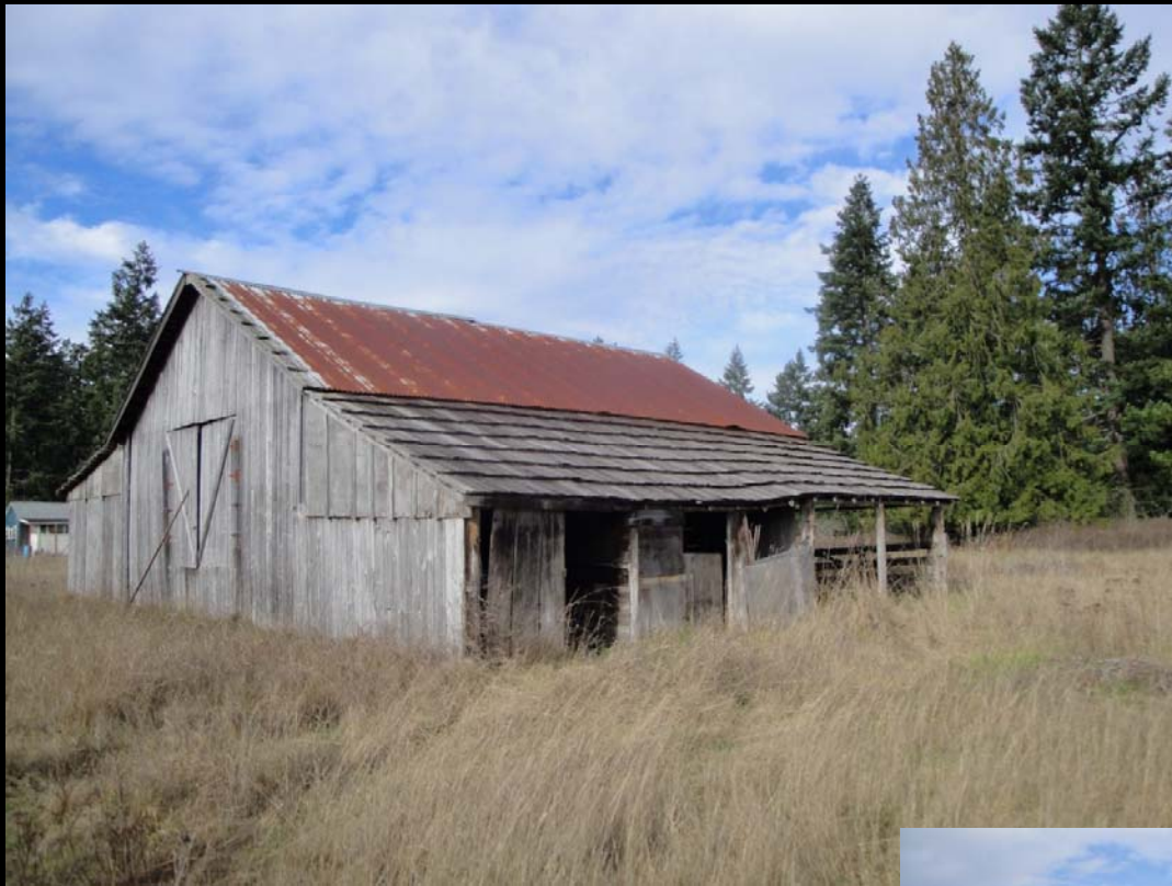
Morse Wildlife Preserve Barn, Graham – c.1910