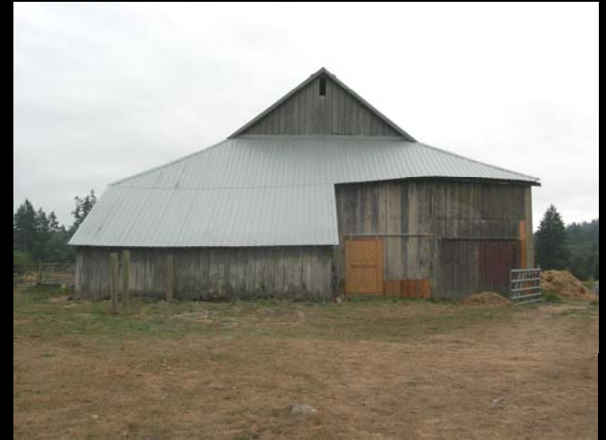
King Barn, Friday Harbor – c.1905