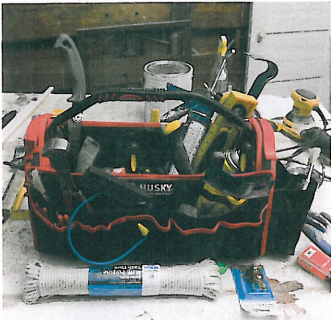
Pam's tool kit includes essentials such as sash rope and a spirit level, plus safety gear such as earplugs. (For details on all the safety gear you'll need for a window-restoration project, see page 57.)

likes because of its narrow dimensions. "I start by breaking the seal with the small pointed tip and turning it, eventually getting the whole narrow edge in so I can gently pry that trim apart," she says. Do this carefully, easing nails out and removing screws if you find any. Gently apply pressure to pry trim away from the wall. After you've created some space, switch to a flat crowbar, again applying gentle force. The bottom sash comes off next. (It's a good idea to mark this—and all other components—so you can be sure to put the window back together correctly. Pam recommends a fine-tip magic marker used in a spot that's not going to be sanded or painted.) After that, the parting stops can be removed. Usually these split when Pam takes them out, but she tries to keep them intact if they're otherwise in perfect condition by using pliers to ease them out once they're loose. She replaces damaged stops with standard 1/2" by 3/4" window trim from the local lumberyard. The top sash comes out last.