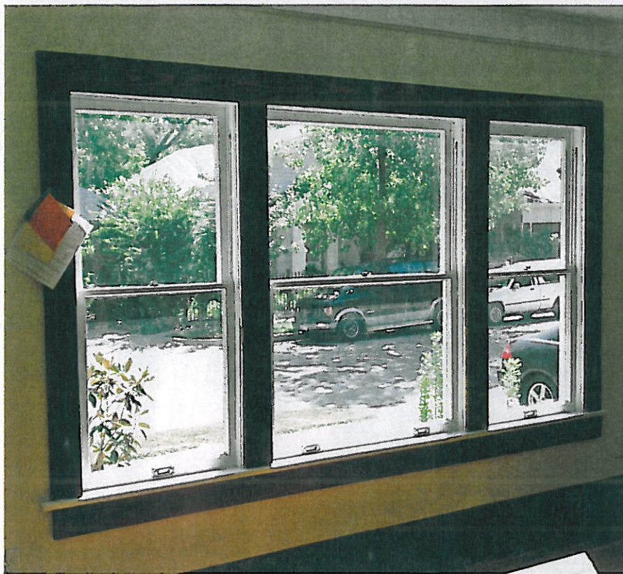
A separate set of windows (also restored by Pam) in the same house reveals the like-new condition a successful restoration project can achieve.

replacement weights to horse trading—eventually, she finds combinations that work, adding washers or nuts to get the balance right. She typically re-shapes old pulleys with pliers, though if she finds one with a point sharp enough to cut a rope, she will replace it entirely. New or old, pulleys need a regular application of spray lubricant to keep them running smoothly. As a general rule, she says, you should grease a pulley when it squeaks. Any lubricant will work, though one that comes with a skinny spray nozzle is easier to apply. If ropes need replacing, Pam prefers cotton over nylon, because it's more authentic and tends to stretch less over time. (Plus, nylon has a greater risk of catching on an old pulley.) Purpose-made products labeled as "sash cord" are available, and, as a rule, lighter-weight cord can be used for smaller windows.