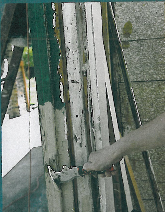
Armed with her 5-in-1 painter's tool, Pam begins cleaning up the window frame by scraping away layers of flaking paint.