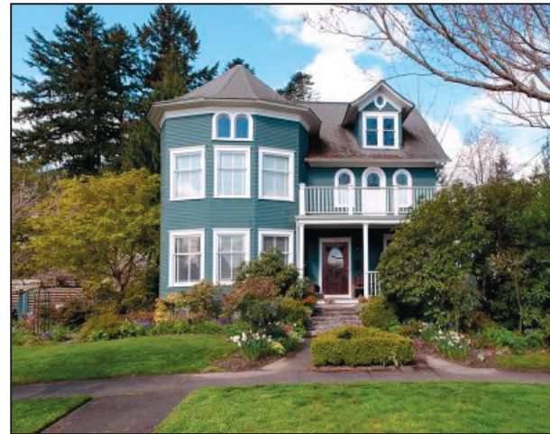
A stately Queen Anne home

The oldest house surviving in the neighborhood, at 202 East 21 Street, was built in 1878, and while modified over time, still displays its basic structure with tall narrow windows and Classic-influenced triangular pediment with returned eaves. In the following decades, houses were built by local carpenters using plan books in styles now called Pioneer or Vernacular. As local mills turned out a variety of trim, houses sported the new decorative elements such as spindle-work, window trim and shingles cut in elaborate patterns. Houses in this Victorian or Queen Anne style expressed an exuberant love of ornamentation that revealed in the bustling new possibilities of the industrial era.