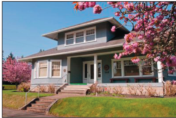
A classic Craftsman bungalow home

But again, changes transformed the neighborhood. As state government grew in the 1960s, the Capitol Campus expanded across Capitol Way to build over an entire section of houses, apartments and Olympia's only high school. The interstate freeway carved off the southern tip and Capitol Lake inundated the winding estuary on the western boundary. The remaining part of the neighborhood consciously began to value its historic structures and shaded streets of