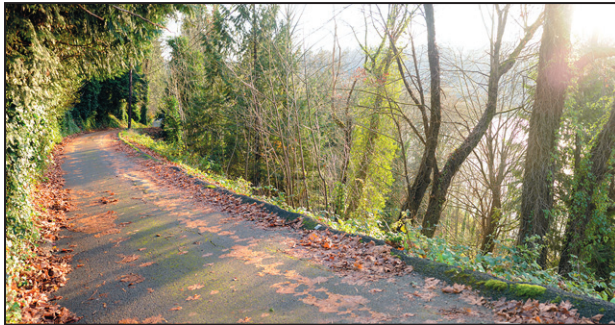
The Old Oregon Trail

The city of Olympia was first settled in the 1840s along the original waterfront and then spread east, west and south up the enclosing hills. The first developments in this area were a trail from Tumwater blazed through the forest and