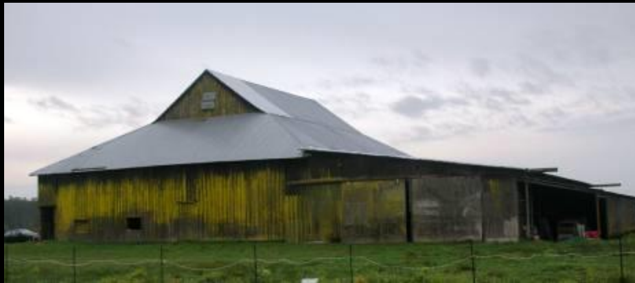
Island Co. – 1880