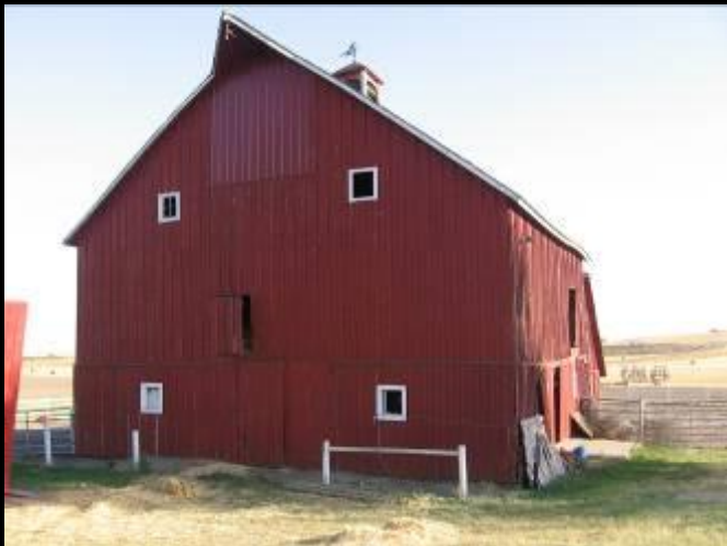
Lincoln Co. – 1902