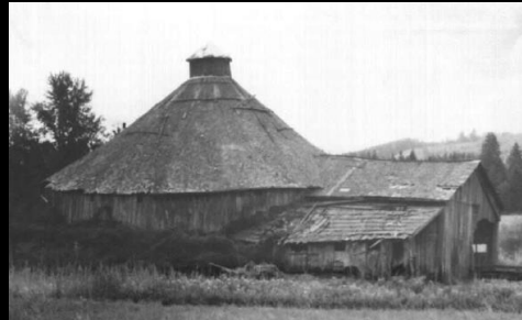
Cowlitz Co. – c.1912