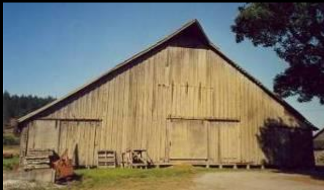
Skagit Co. – c.1895