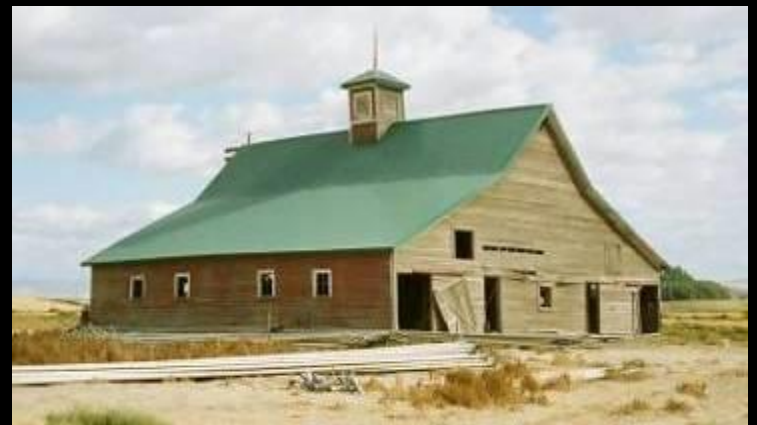
Walla Walla Co. – 1880