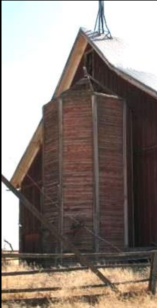
Wooden Octagonal Silo Asotin Co – c.1895