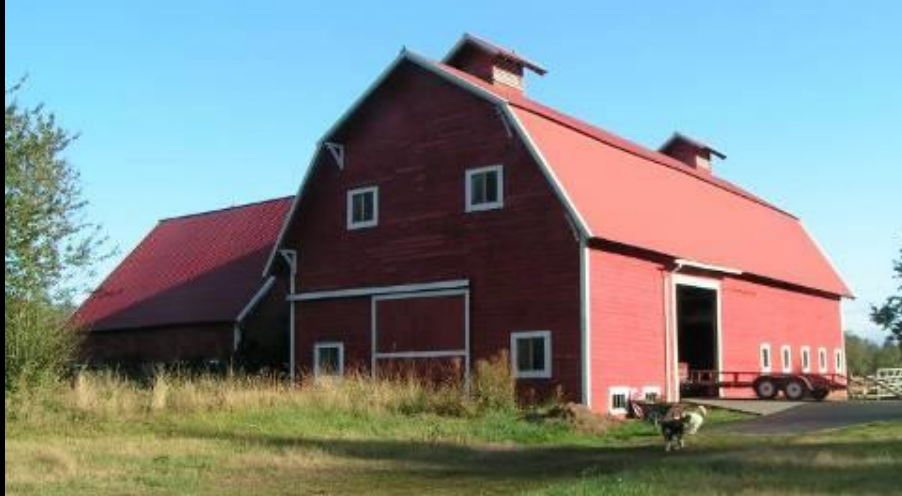
Thurston Co. – c.1930