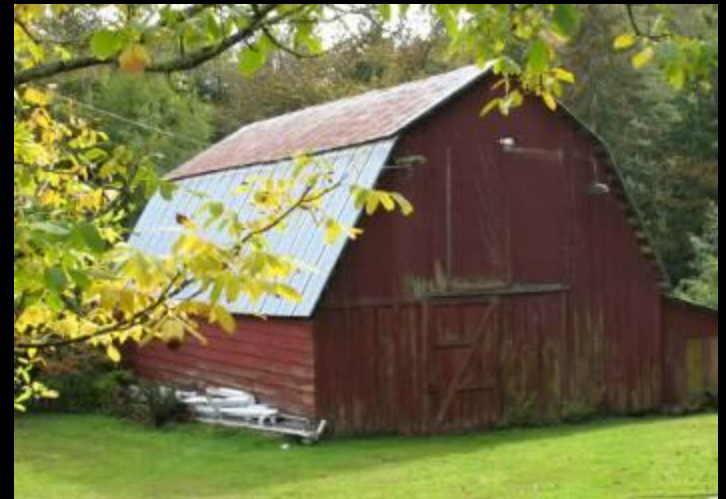
Whatcom Co. - 1923