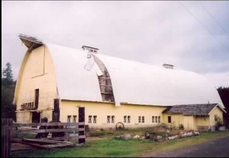
Grays Harbor Co. – 1931