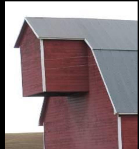
Whitman Co.– 1925