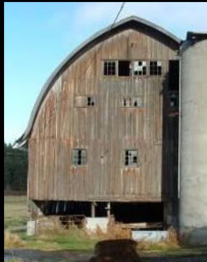
Island Co. – 1919