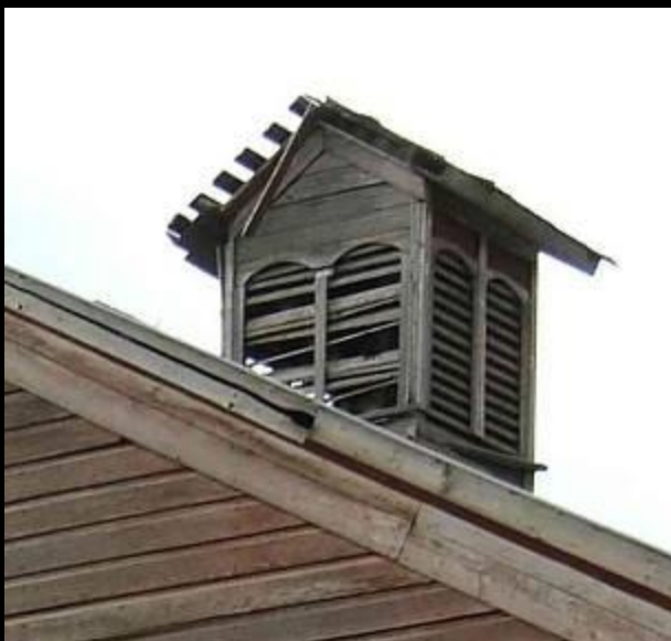
Walla Walla Co.– 1890