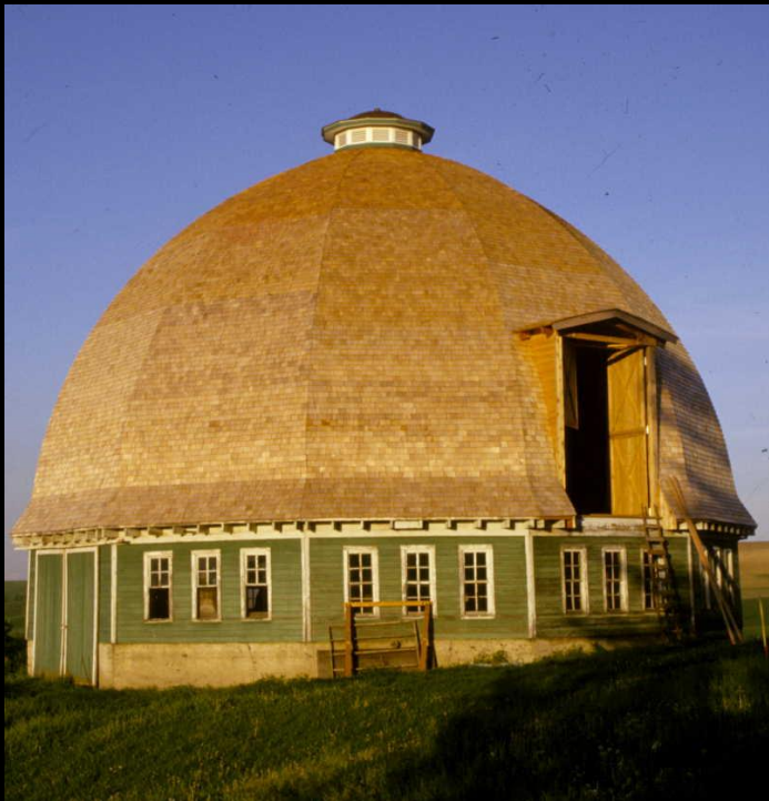
Whitman Co. - 1917