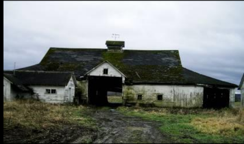
Snohomish Co. – c.1900