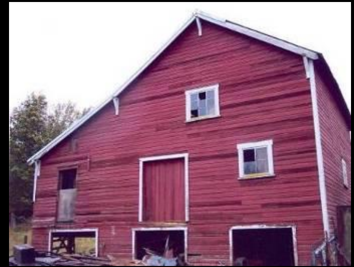
Pierce Co. – 1915