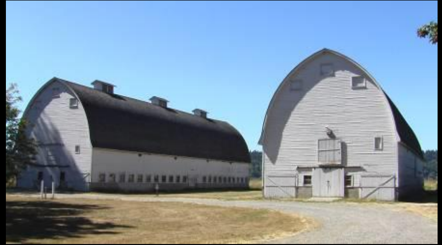
Thurston Co. – c.1925