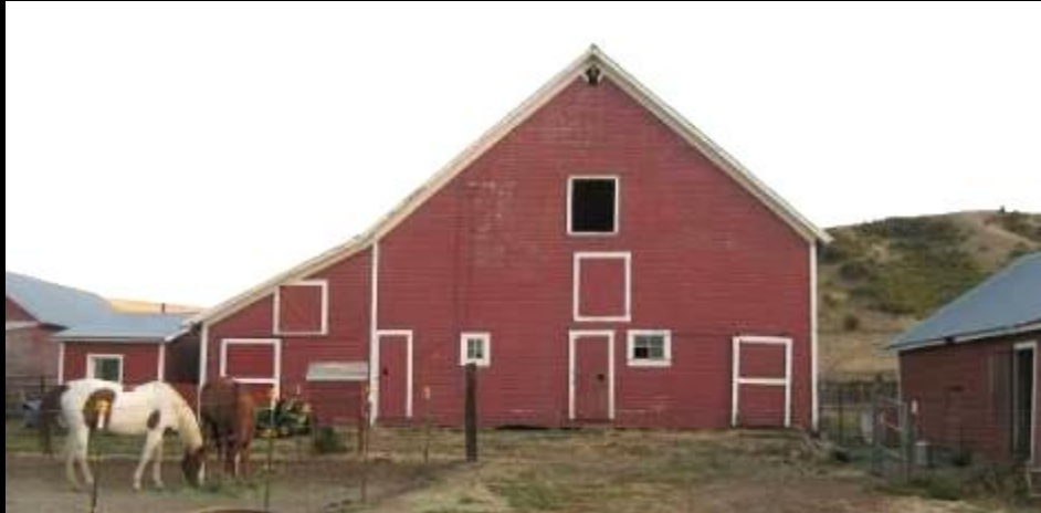
Columbia Co. – 1881