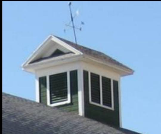
Spokane Co. – 1926