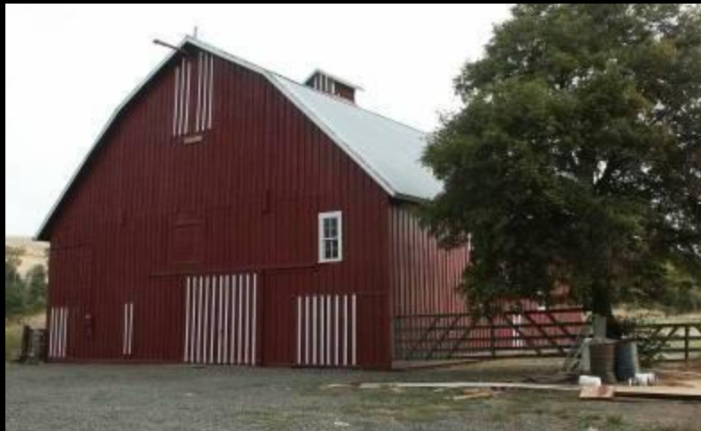
Columbia Co. - 1908