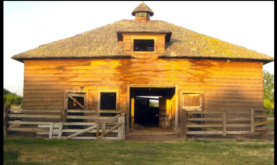
Yakima Co. – c.1890