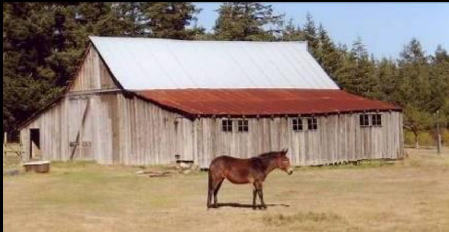
San Juan Co. – c.1890