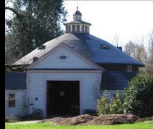
Lewis Co. – c. 1905