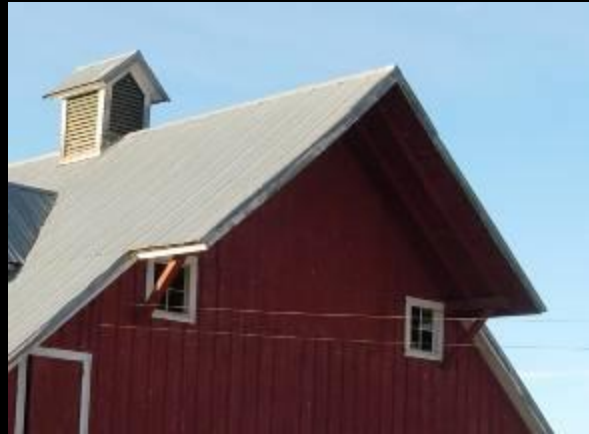
Whitman Co. - 1929