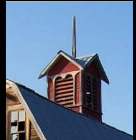
Pend Oreille Co. – 1901