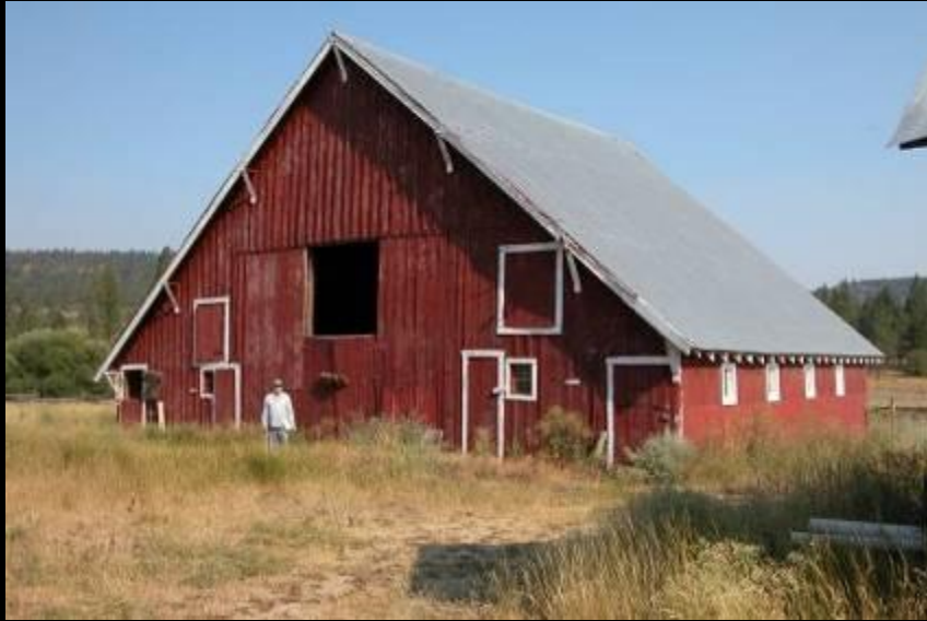
Stevens Co. – 1926