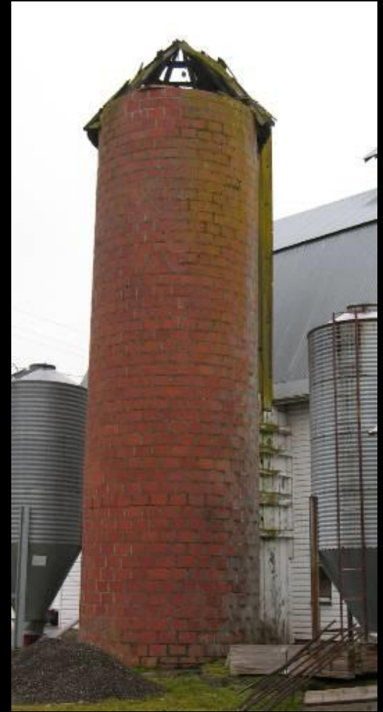
Glazed Tile Silo