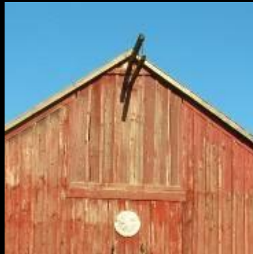
Island Co.- 1902