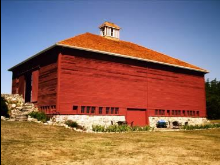
Island Co. – 1895