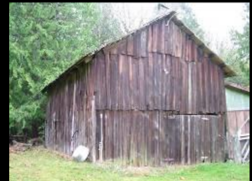
Kitsap Co. – 1933