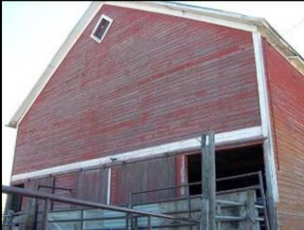
Adams Co. – 1901