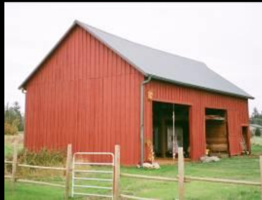
Skagit Co. – 1904