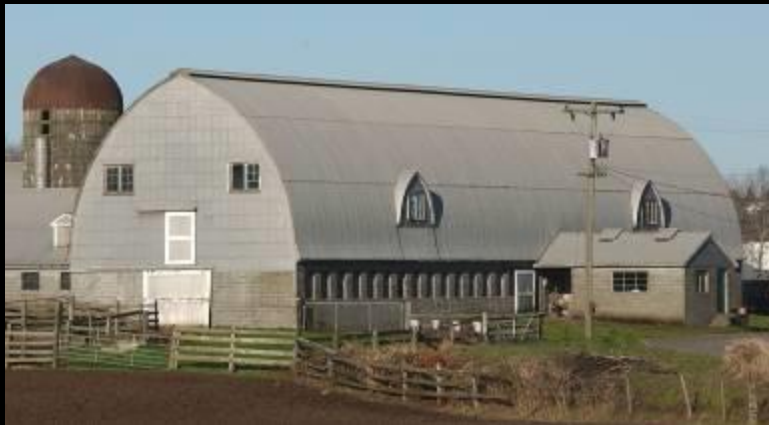
Clark Co. – 1930