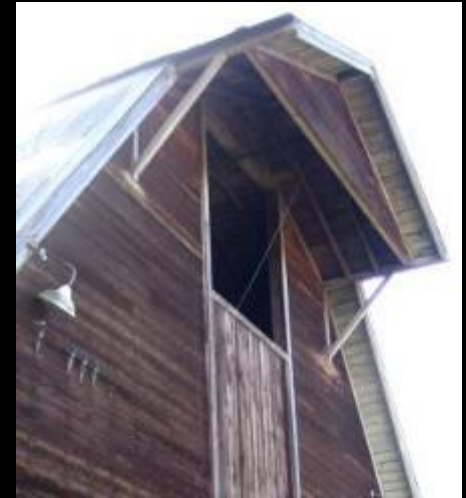
Pierce Co.– 1915