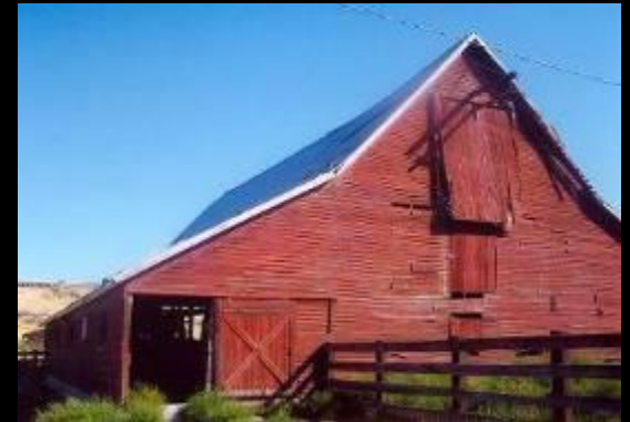
Franklin Co. – 1912