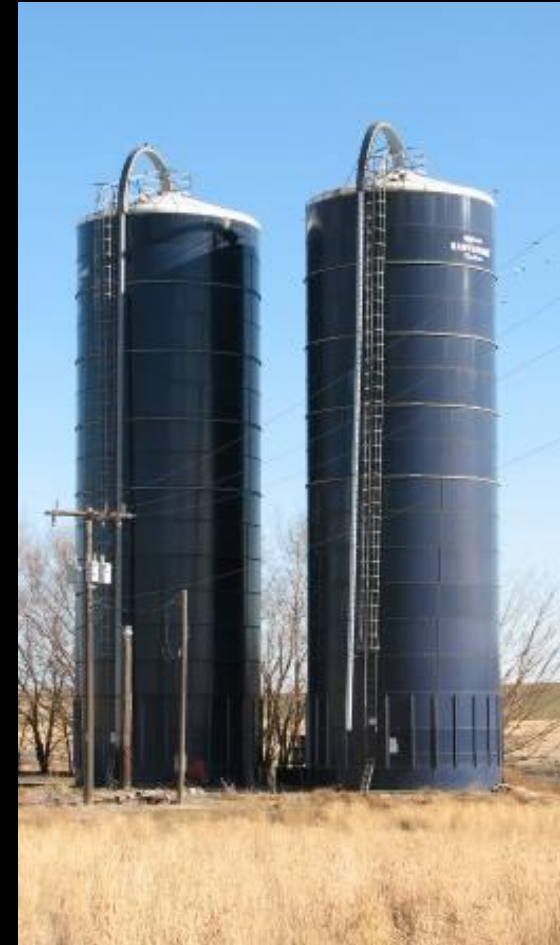
Harvestore Silos Adams County - c. 1948