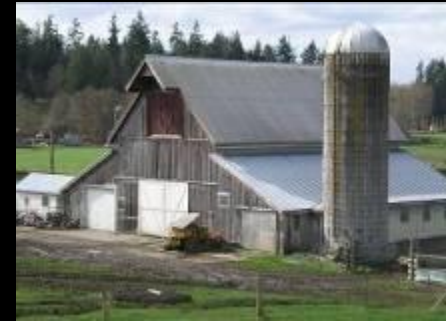
Kitsap Co. – 1938