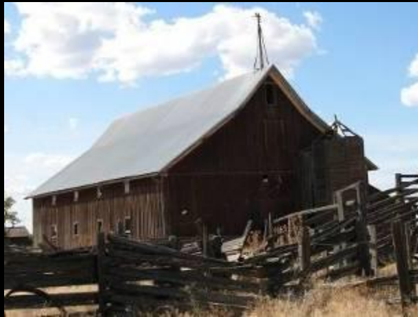
Asotin Co. – c. 1895