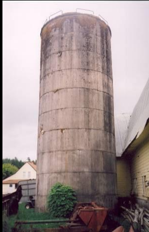
Poured Concrete Silo Grays Harbor Co. – c.1935