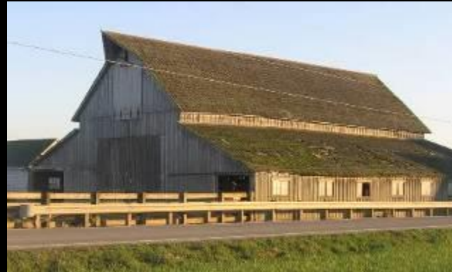
Skagit Co. – c.1900