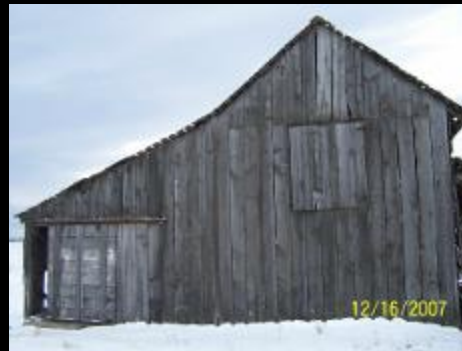
Klickitat Co. – c.1910