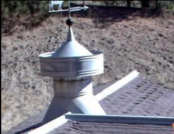
Whitman Co. – 1935