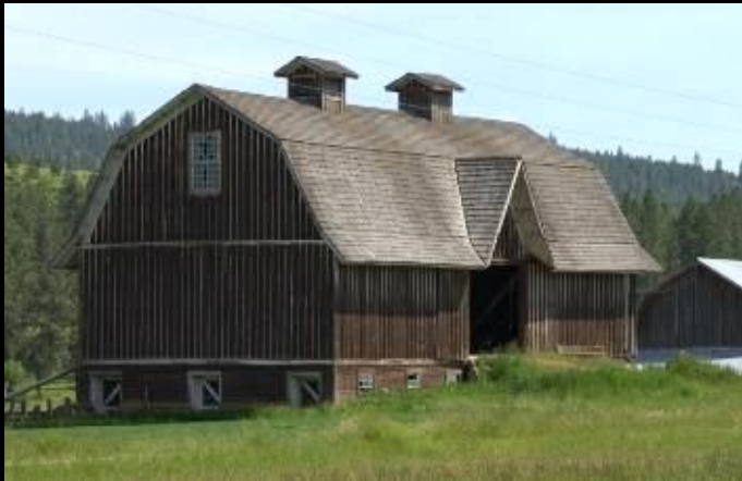
Spokane Co - c. 1925