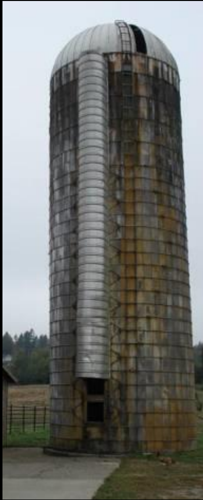
Concrete Stave Silo