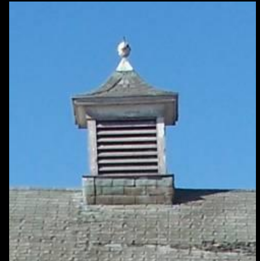
Adams Co. - 1901