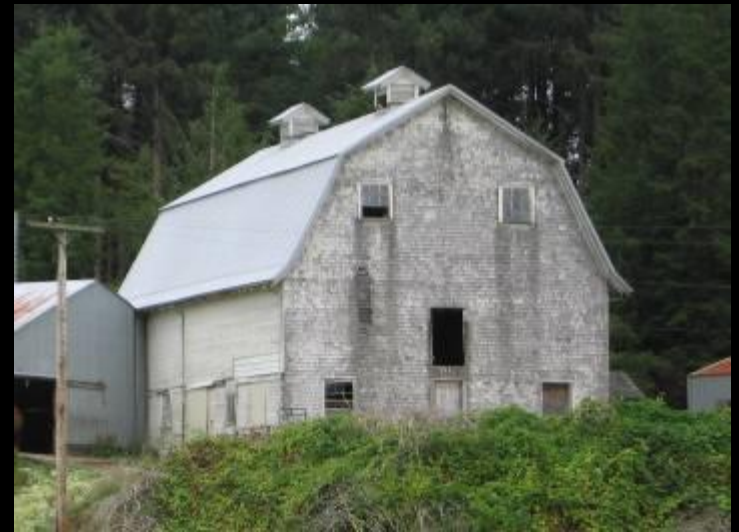
Wahkiakum Co. - 1929