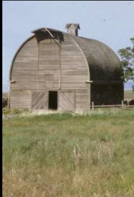
Asotin Co. – c.1925