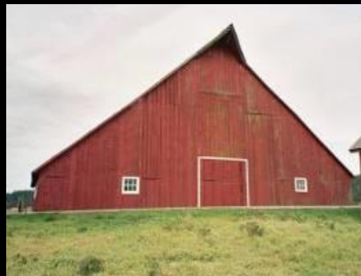
Snohomish Co. – c.1886