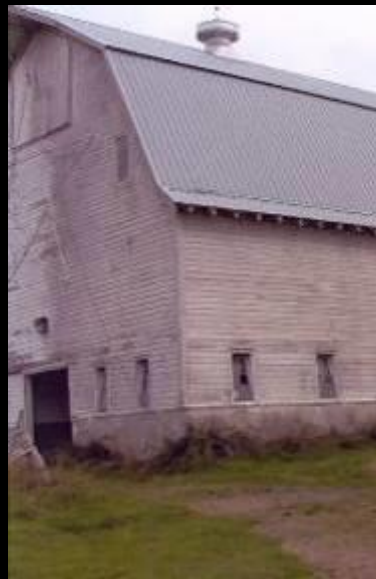
Pacific Co. - c.1956