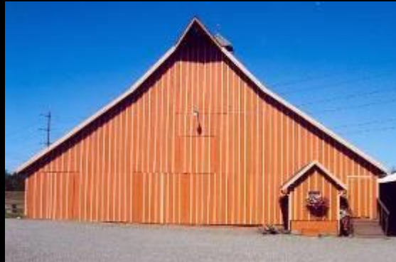
King Co. – 1911