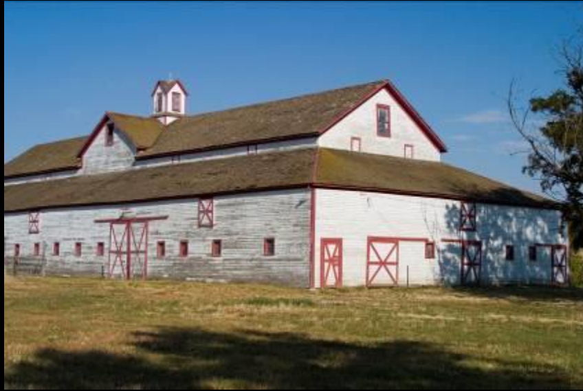
Walla Walla Co. – 1893