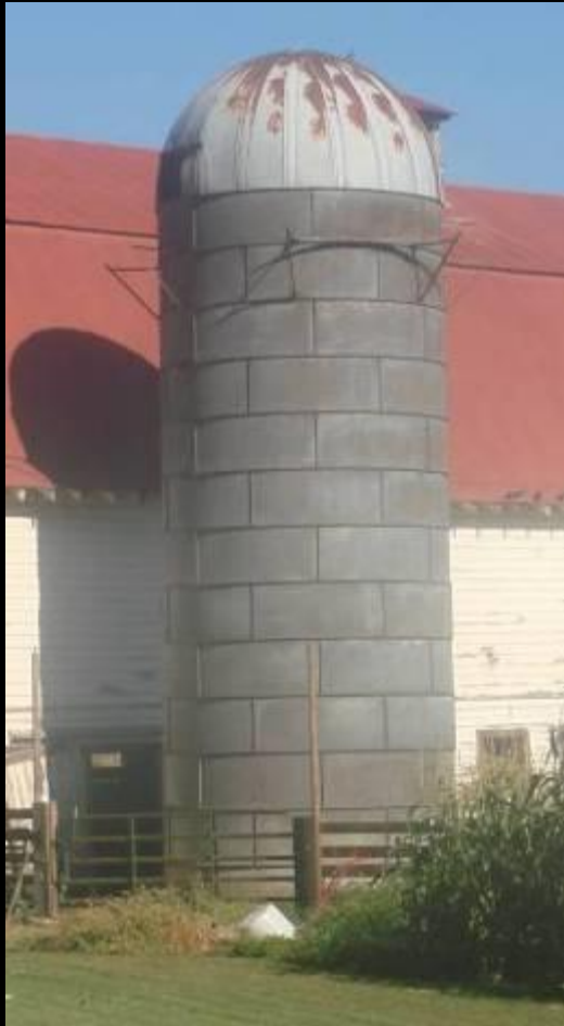
Steel Paneled Silo Pierce Co. – c.1935