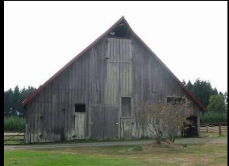
Lewis Co. – 1917