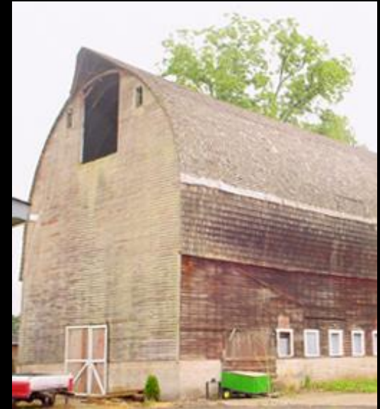
Clark Co. – 1938