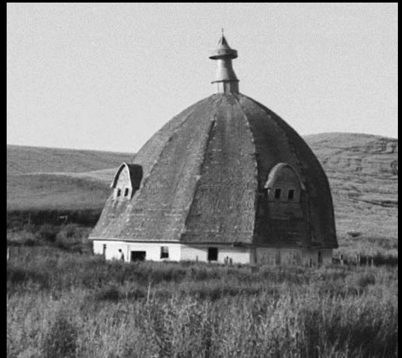
Whitman Co. - 1916