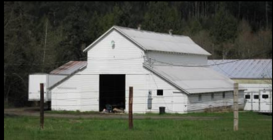
Thurston Co. – c.1930