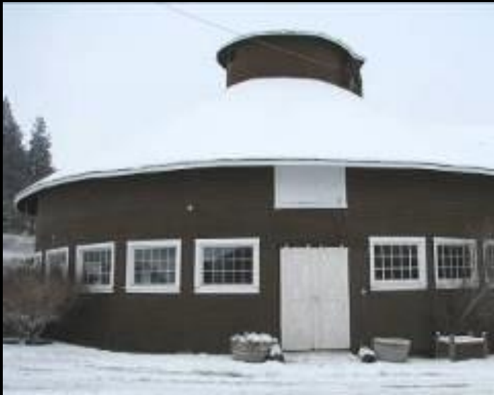
Spokane Co. - 1916