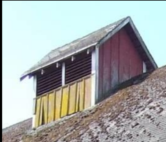
Snohomish Co. – 1932