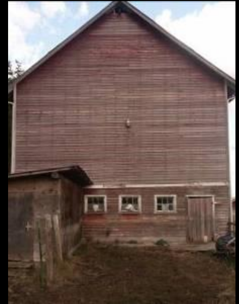
Peirce Co. – 1910