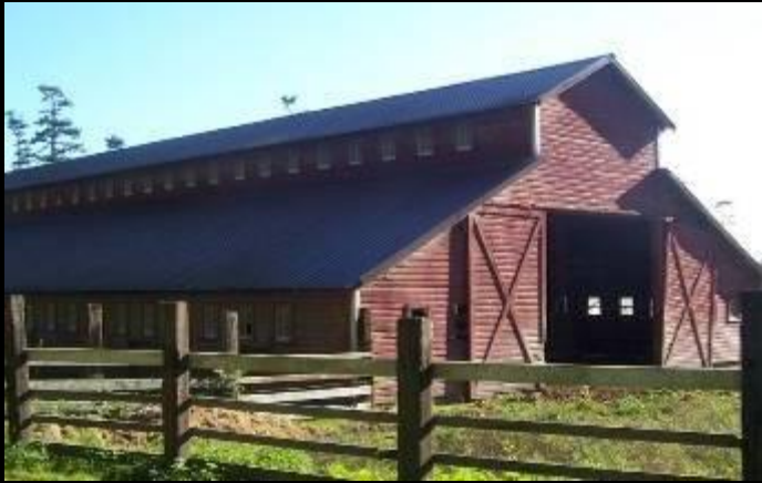
Island Co. – 1942