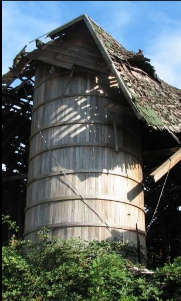
Vertical Wood Stave Silo Clark Co. – c.1900