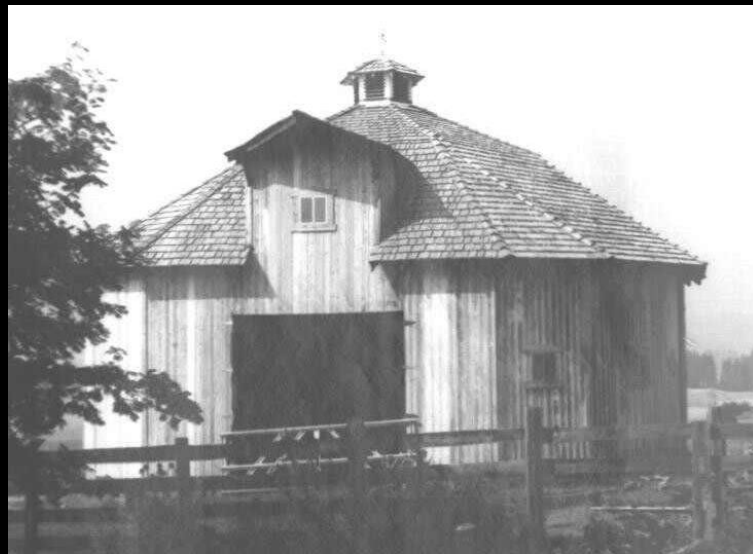
Spokane Co. - 1915