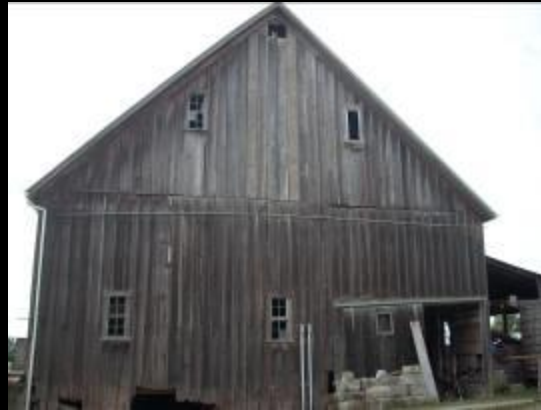
Skagit Co. – 1890