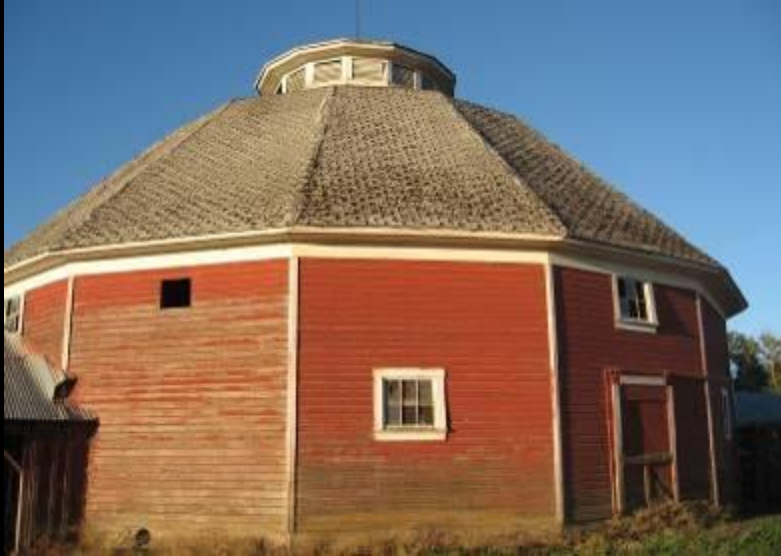
Klickitat Co. – 1915