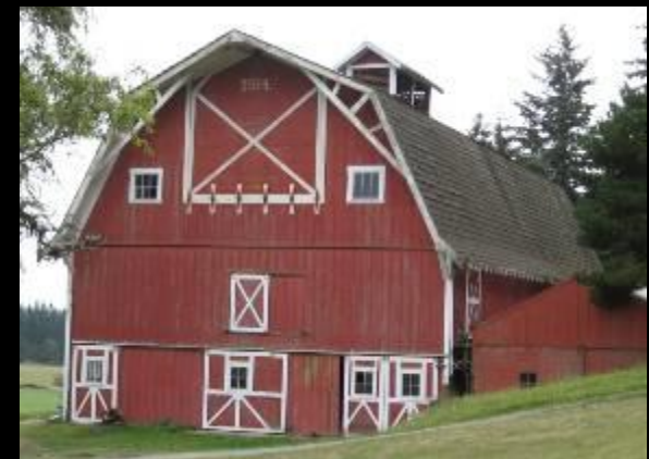
Island Co. - 1914