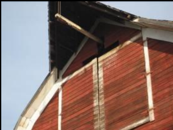
Kittitas Co.- 1906