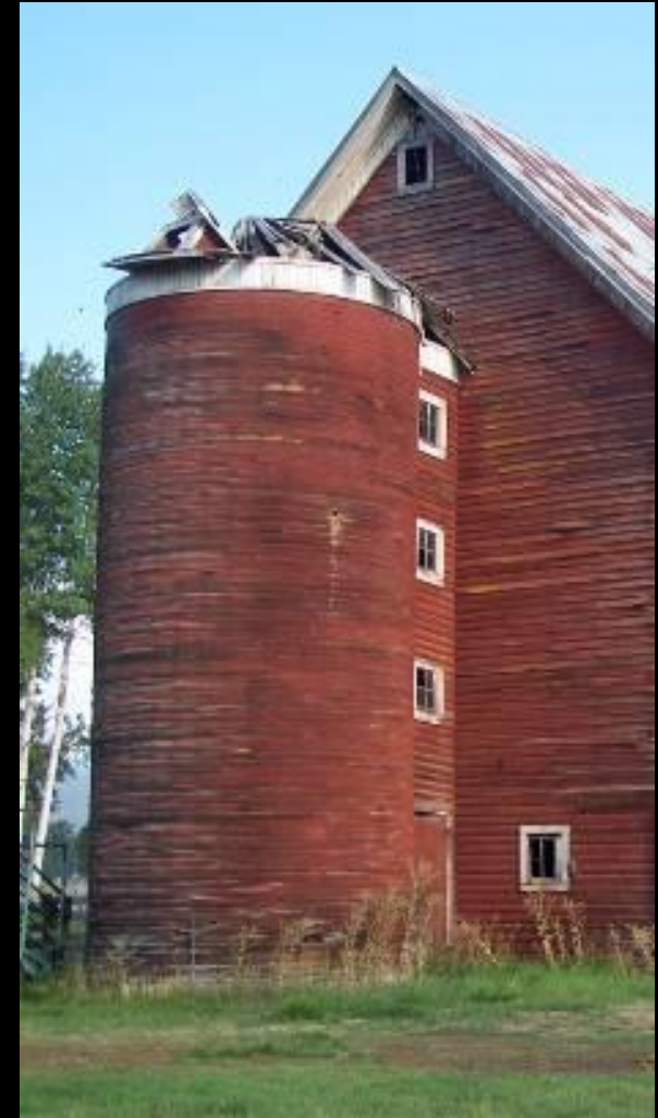
King Silo Klickitat Co. – 1920