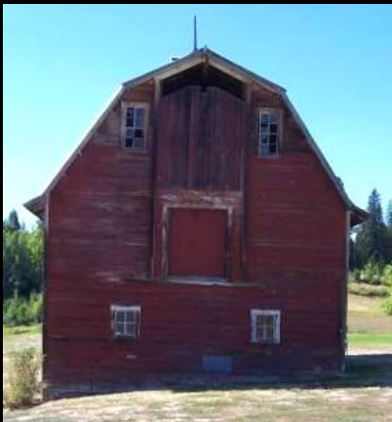
Pend Oreille Co. - 1916