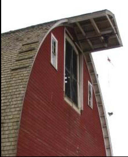
Garfield Co. – c.1910