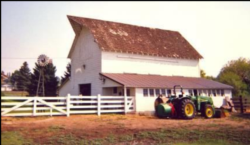
Yakima Co. – 1930