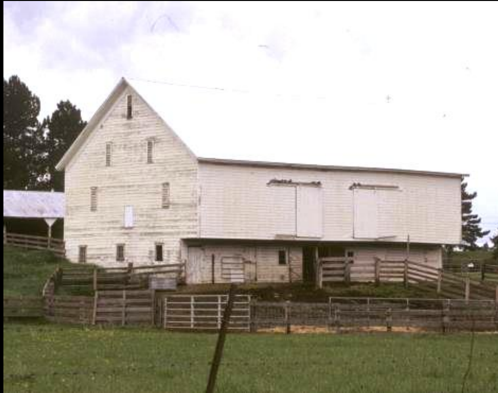
Whitman Co. – c.1910