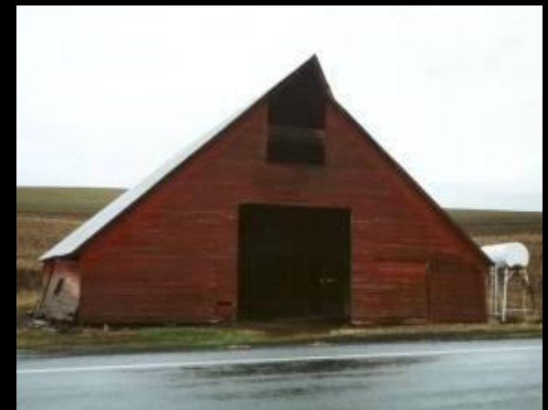
Whitman Co. – c.1920