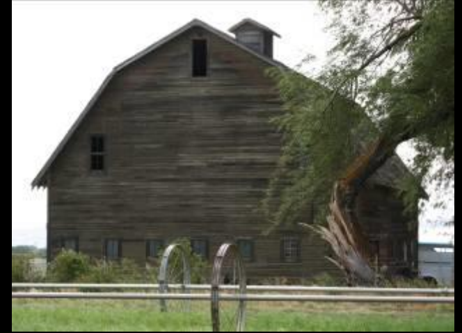
Kittitas Co - 1927