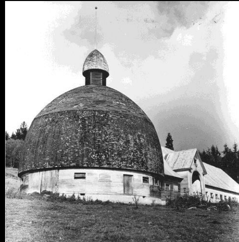
Wahkiakum Co. – c. 1912