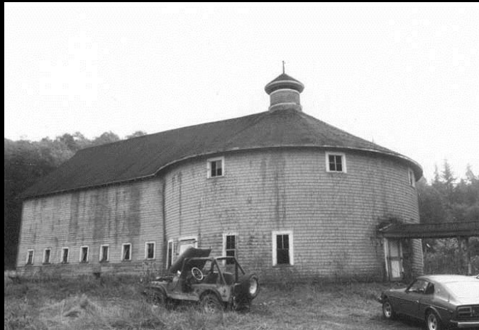
Snohomish Co. – c.1914