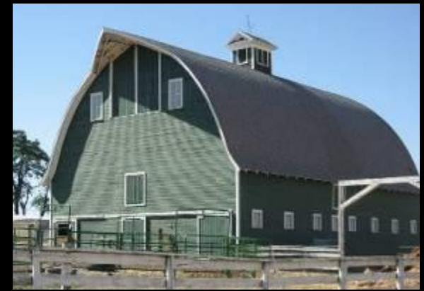
Spokane Co. – 1926