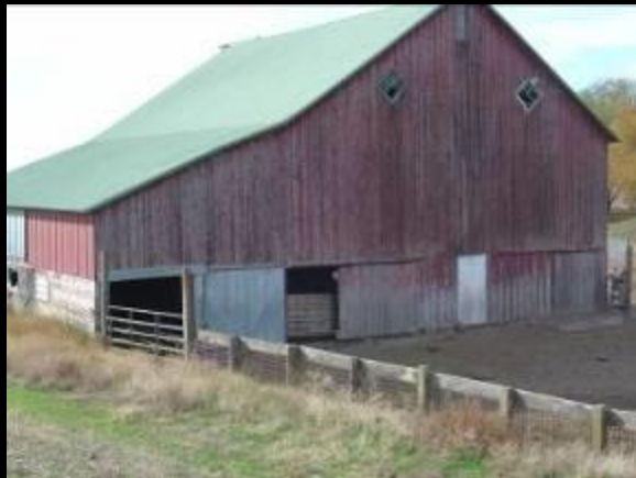
Lincoln Co. – 1900