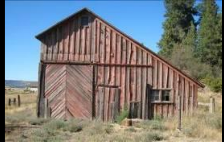
Spokane Co. – 1948