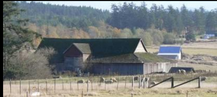
San Juan Co. – c.1890