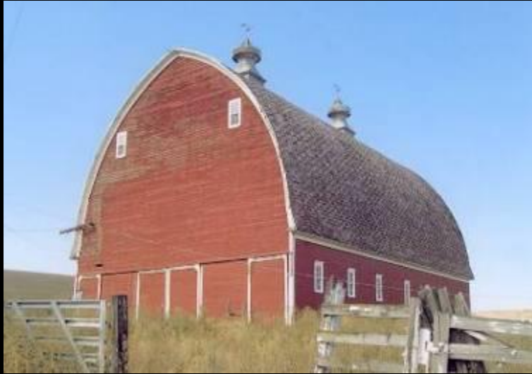
Whitman Co. – 1917