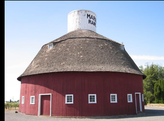
Yakima Co. – c.1914