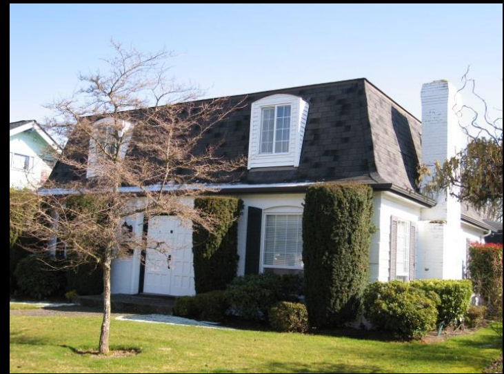
House Tacoma, c.1980