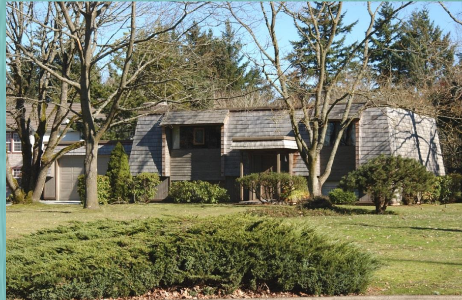
House Vancouver, c.1978