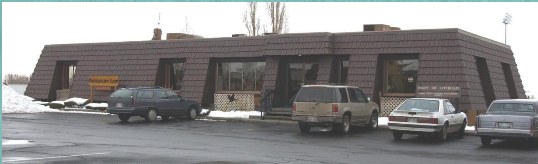
Building Othello, c.1972