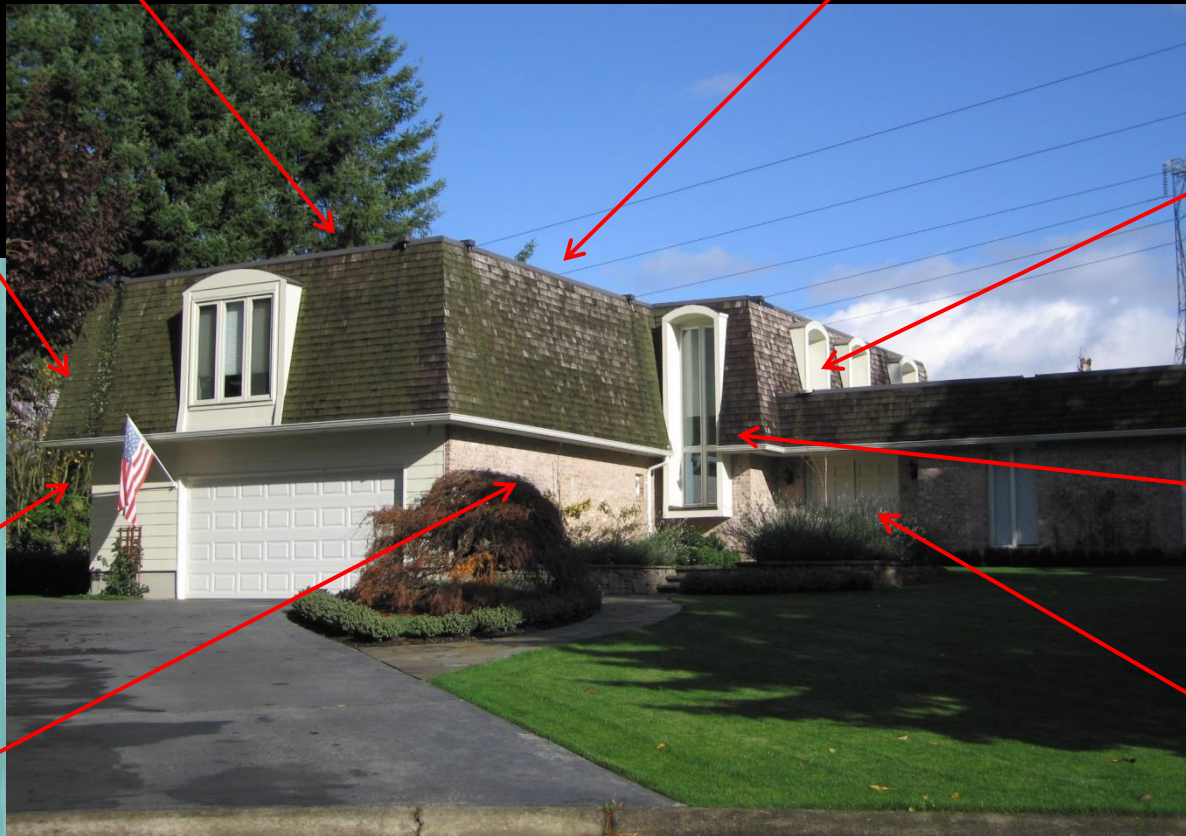
House Kent, c.1970