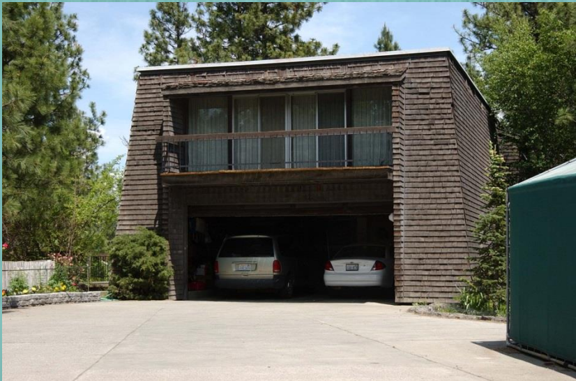
Dr. Sonneland House Spokane, c.1972