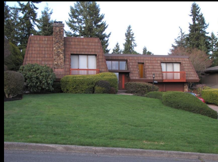
House Bellevue, 1966