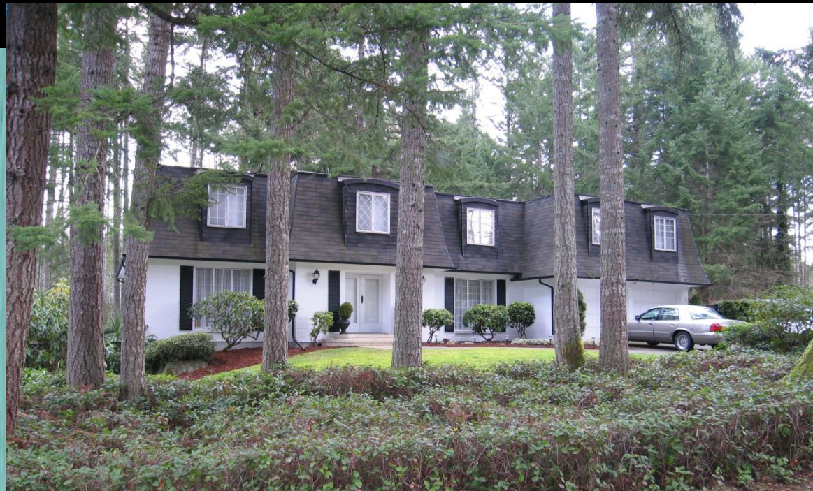
House Olympia, c.1970