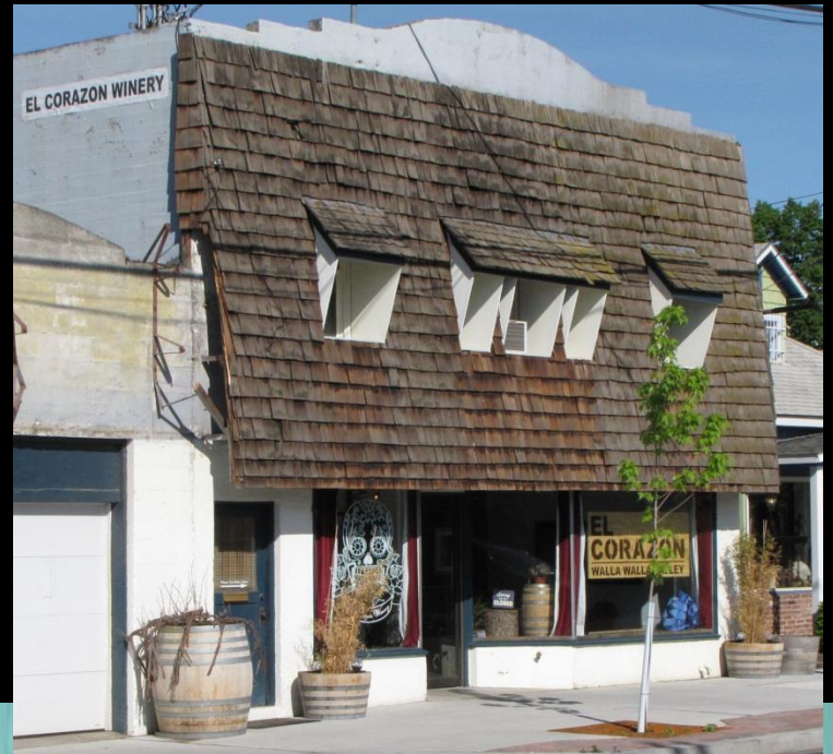
Building Walla Walla, c.1978