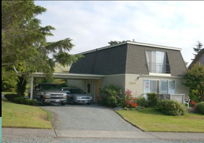
House Anacortes, c.1978