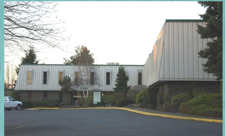
Timberline Building Vancouver, c.1978