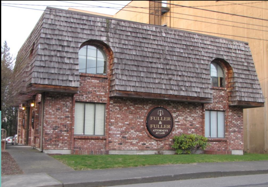
Law Office Tumwater, c.1978