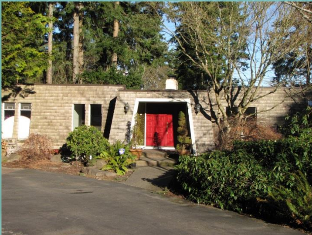
House Puyallup, c.1975