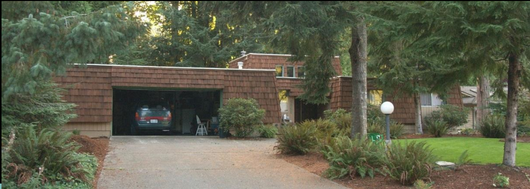
House Olympia, c.1975