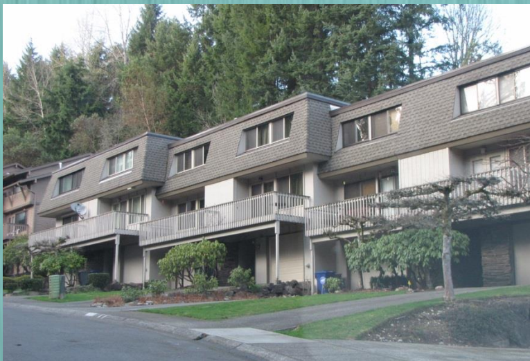
Apartment Bellevue, c.1972