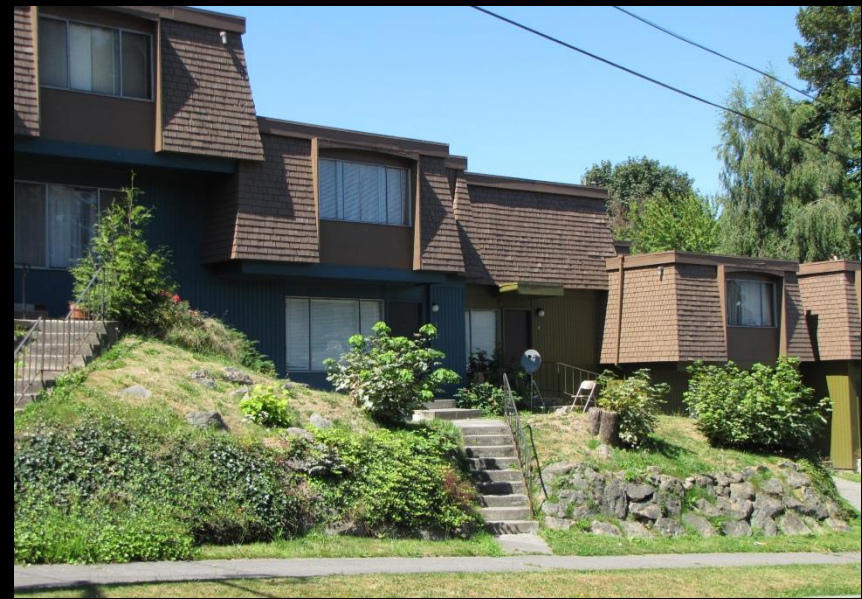
Apartment Seattle, c.1970