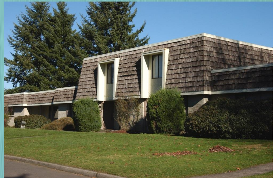
Apartments Vancouver, c.1978