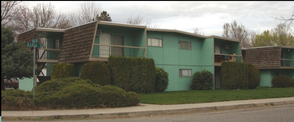
Apartment Kennewick, c.1978