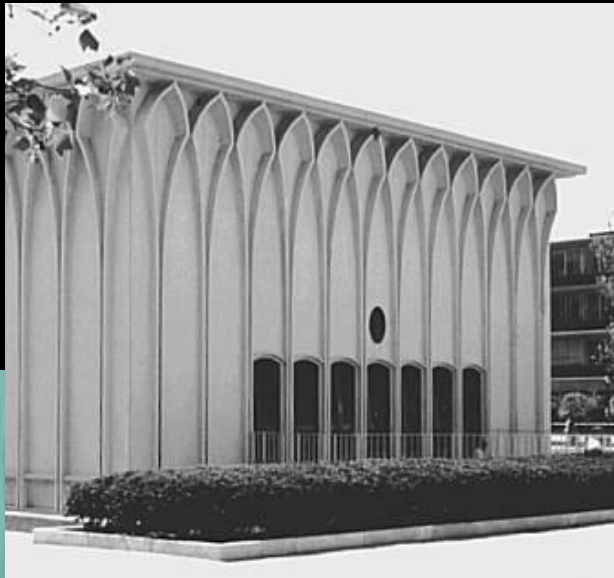
Helen L. DeRoy Auditorium, Wayne State University Minoru Yamasaki, Detroit, MI, 1955-59