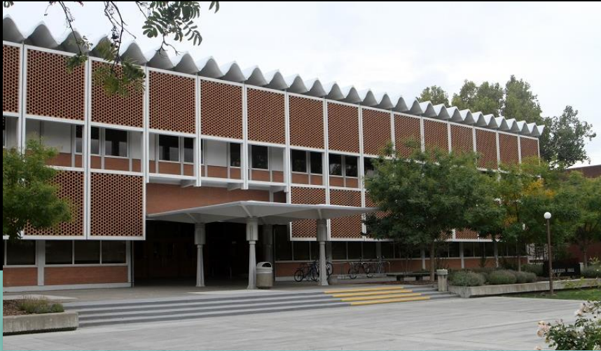
Bouillon Hall – CWU Ellensburg, 1961