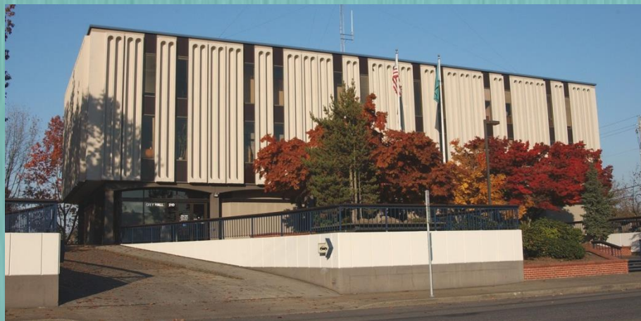
City Hall Vancouver, 1966