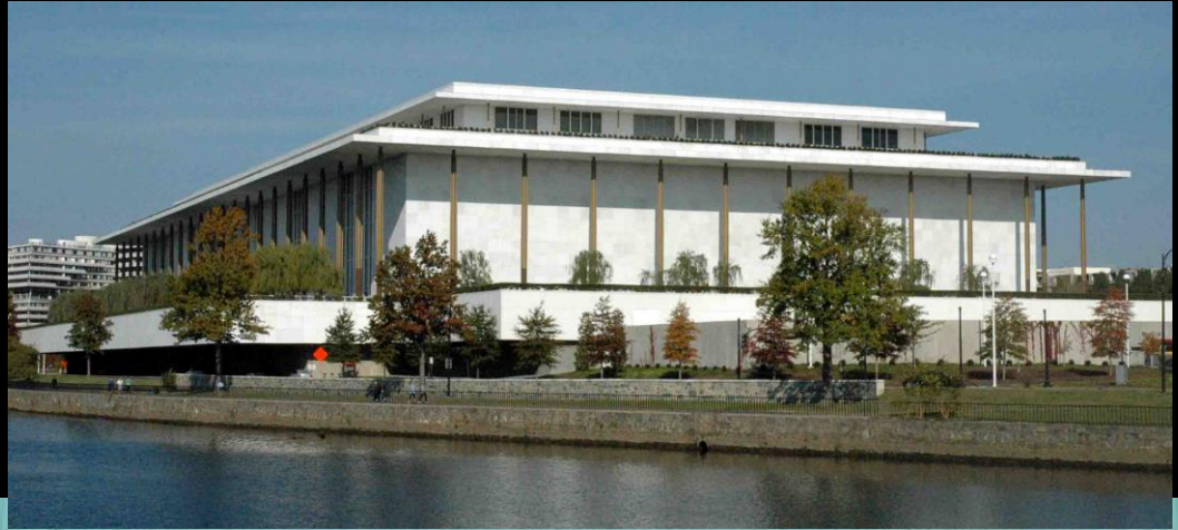
Kennedy Center Edward D. Stone, Washington DC, 1971