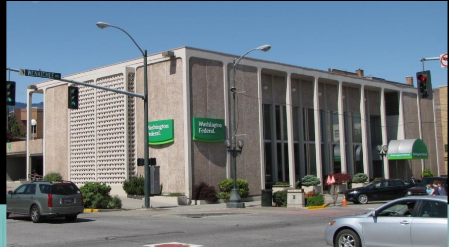
Bank Wenatchee , c1965