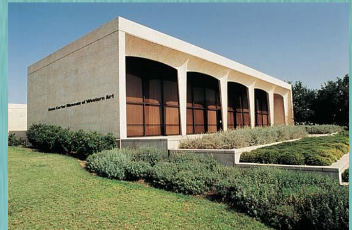
Amon Carter Museum of Western Art Philip Johnson, Fort Worth TX, 1961