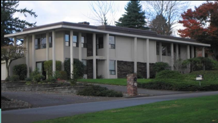
House Kent, 1971