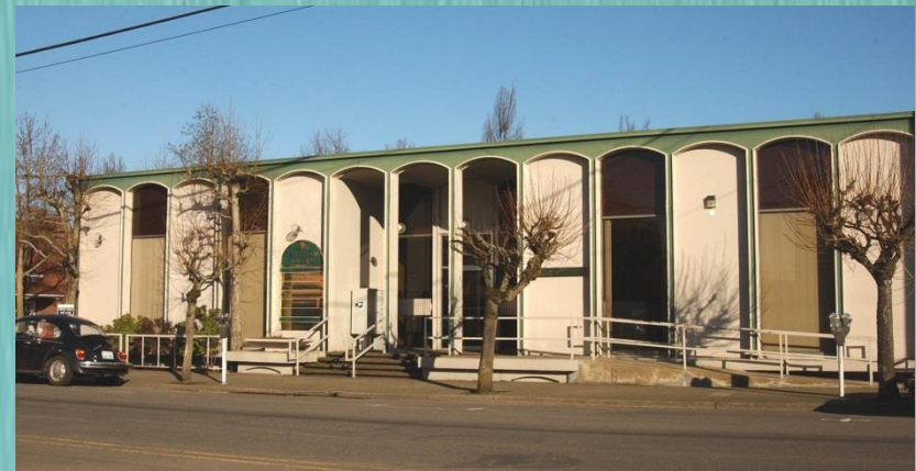
Building Vancouver, c1966