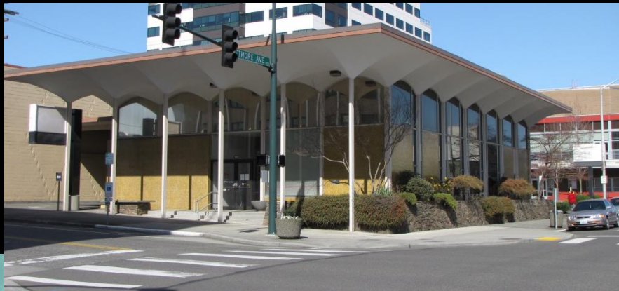
Bank of Everett Everett, 1963