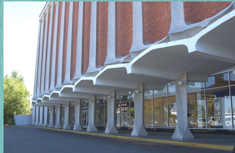
Bon Marche Tacoma, c1968