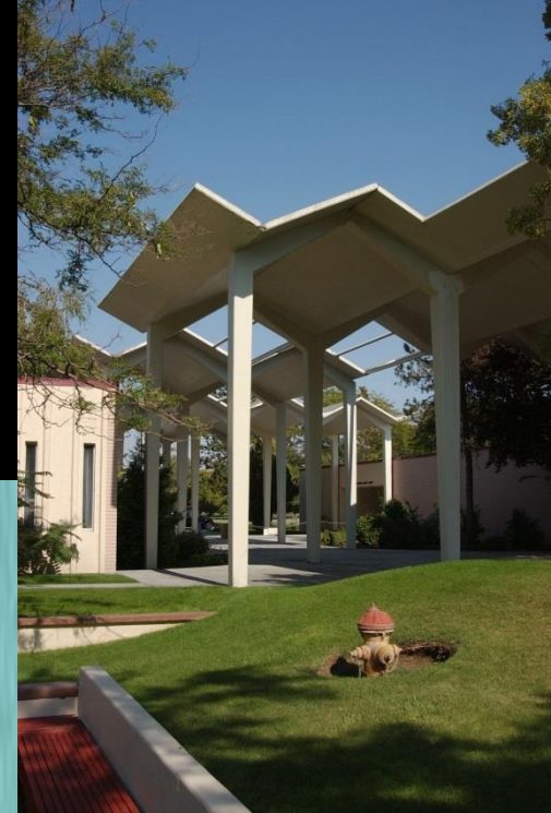
Big Bend Community College Moses Lake, 1968