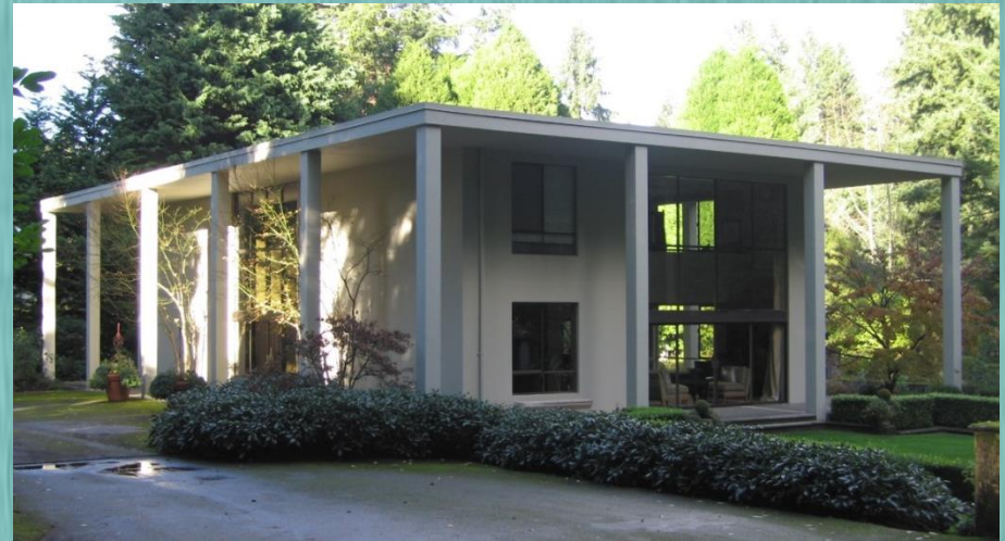
House Shoreline, c1966