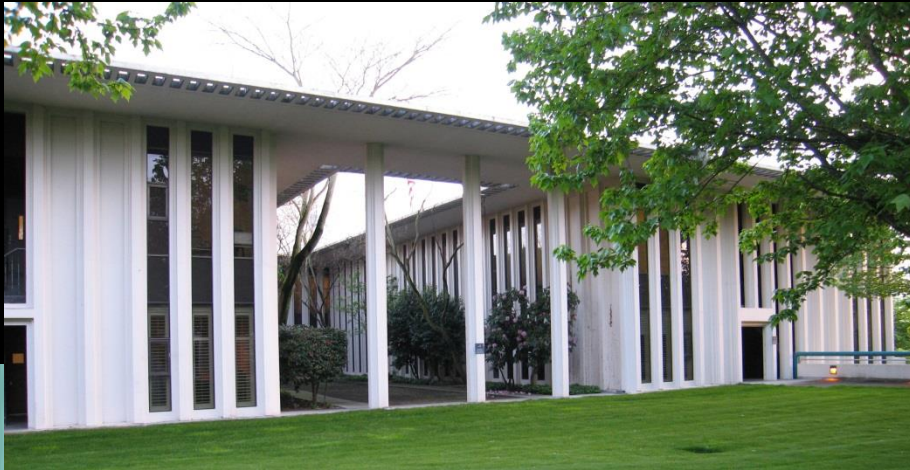
Valley General Hospital Kent, 1967