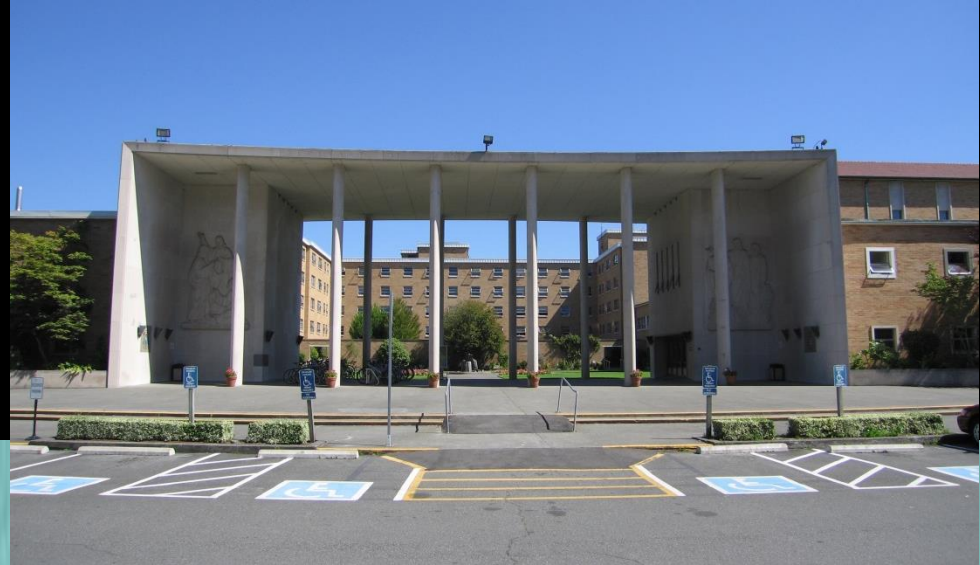
St. Thomas Seminary Kenmore, 1958