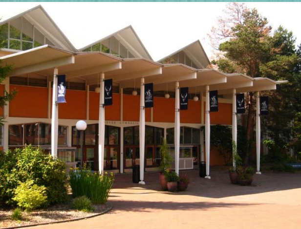
Carver Gymnasium - WWU Bellingham, 1961