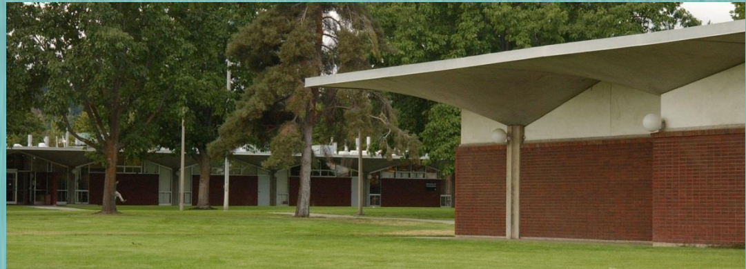
Spokane Falls Community College Spokane, 1967