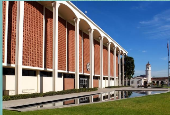
Fullerton City Hall Smith, Powell & Morgridge, Fullerton, CA, 1963