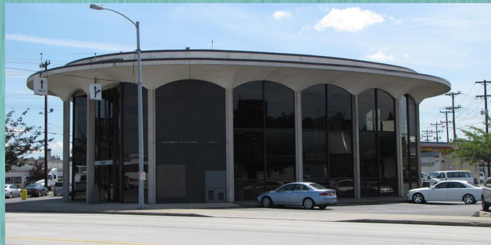
National Bank of Commerce Seattle, 1968