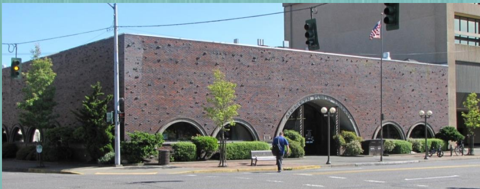
Library Aberdeen, 1965