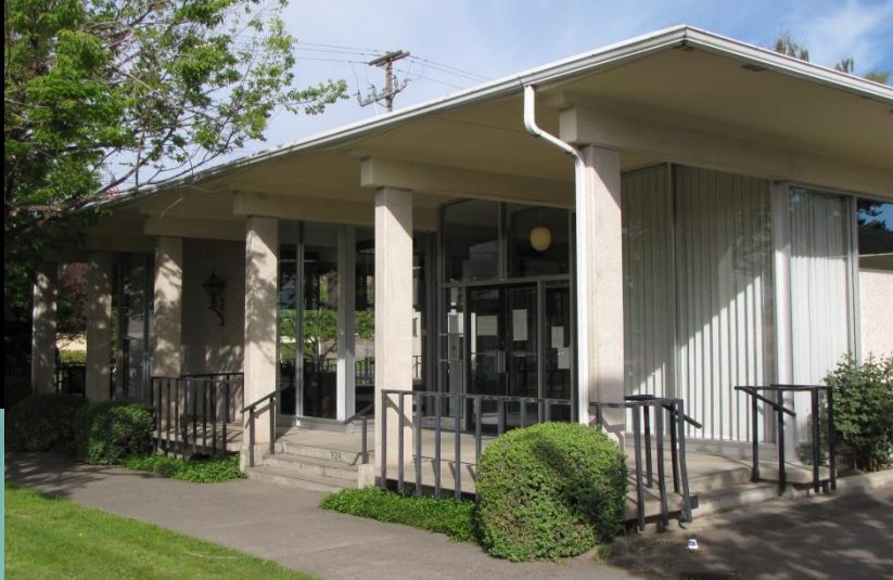
Cascade Natural Gas Walla Walla, c1965