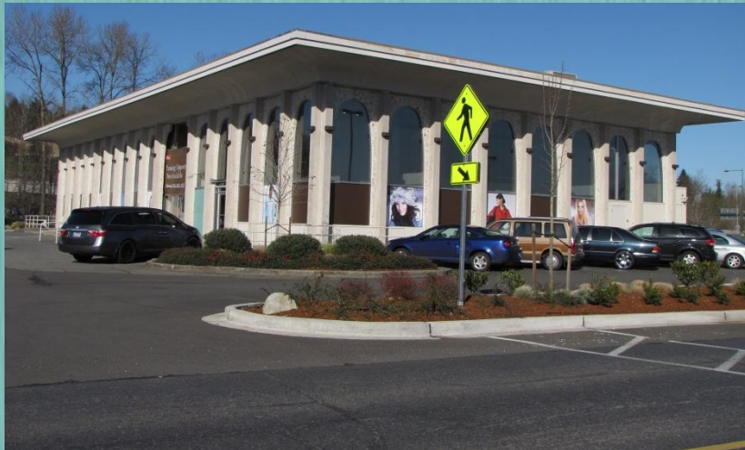
Bank Sea Tac , c1968