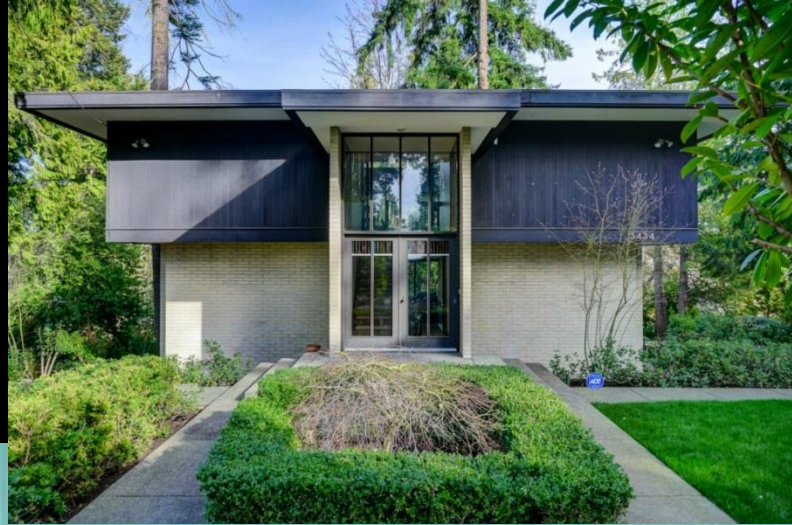
Dr. Thomas Morgan Jr. House Medina, 1964