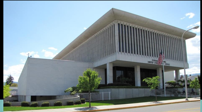
Federal Building Wenatchee, c1965