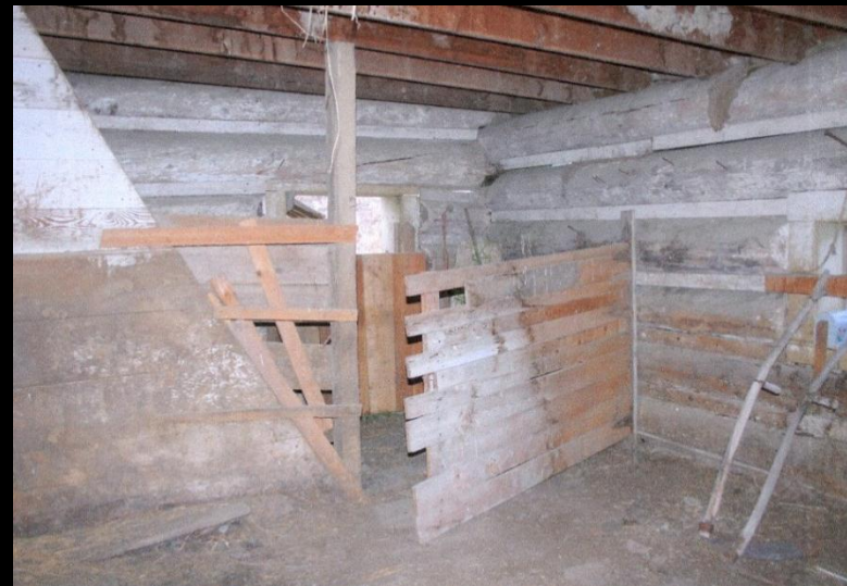
Sweet Creek Ranch, Ione – c.1911