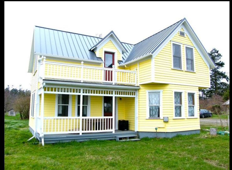
Rosehip Farm, Coupeville – c1895