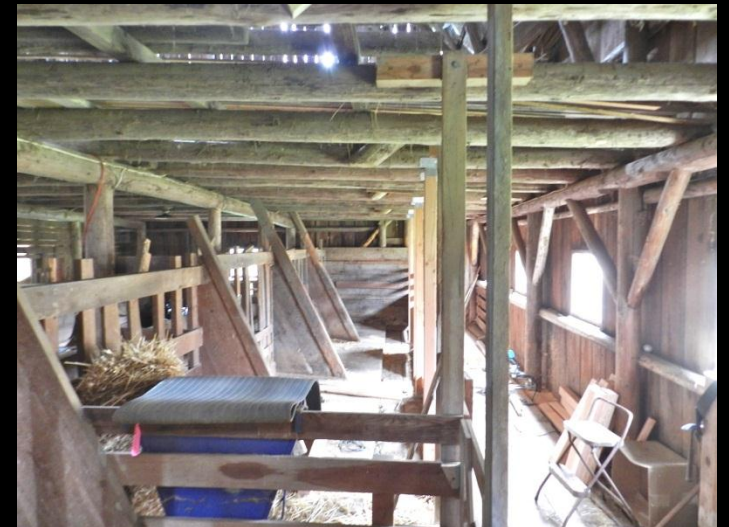
Tu & Wolinsky Farm, Green Bank – 1918