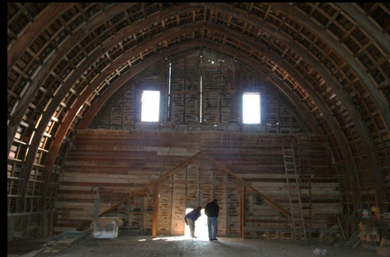
Lauritzen Farm, Wilbur – 1918