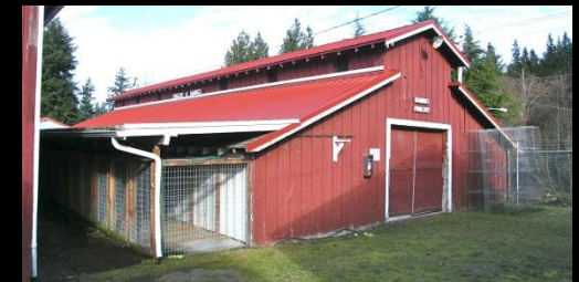
Island County Fairgrounds, Langley – 1937