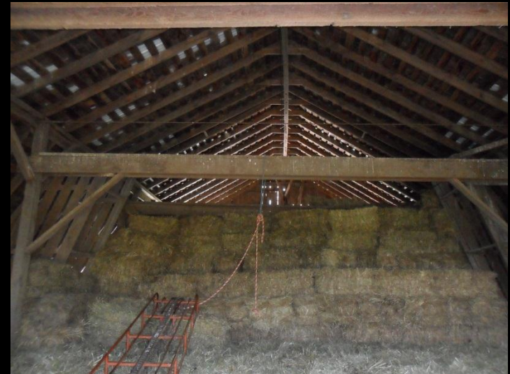
JKTJ Courtney Herefords, Lynden – 1912