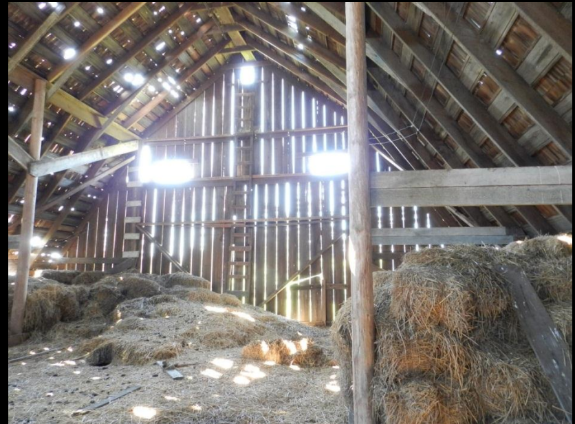
Comstock Barn, Coupeville— 1935