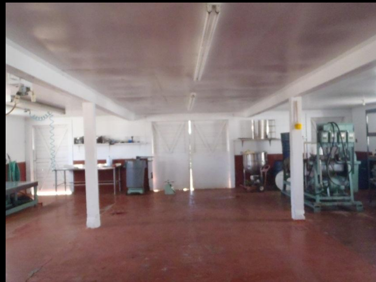
Broers Farm, Monroe – c.1935