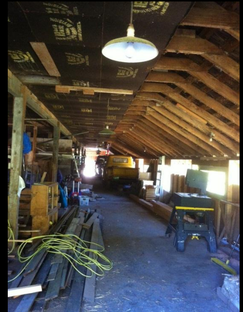
Kelsey Family Farm, Brush Prairie – 1959