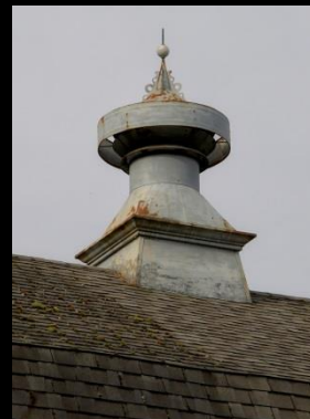
Wedderburn Farm, Olympia – c.1935