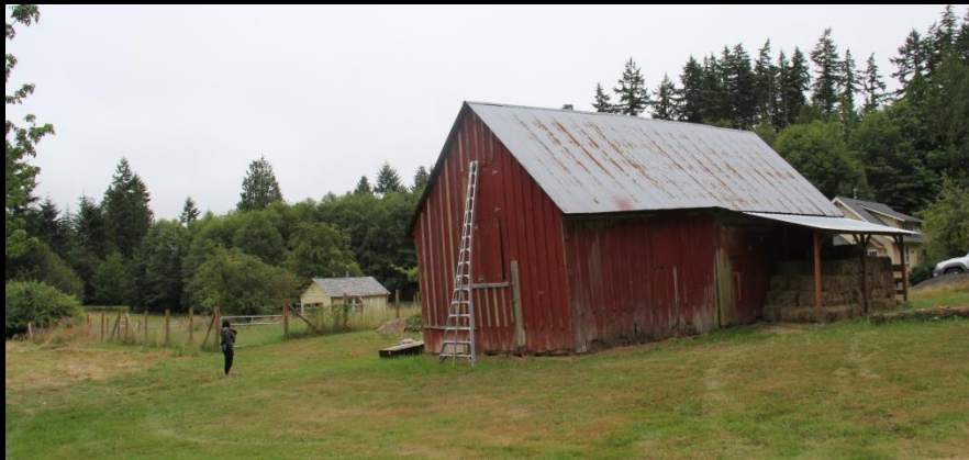
Kokko-Thompson Farm, Poulsbo – c.1903