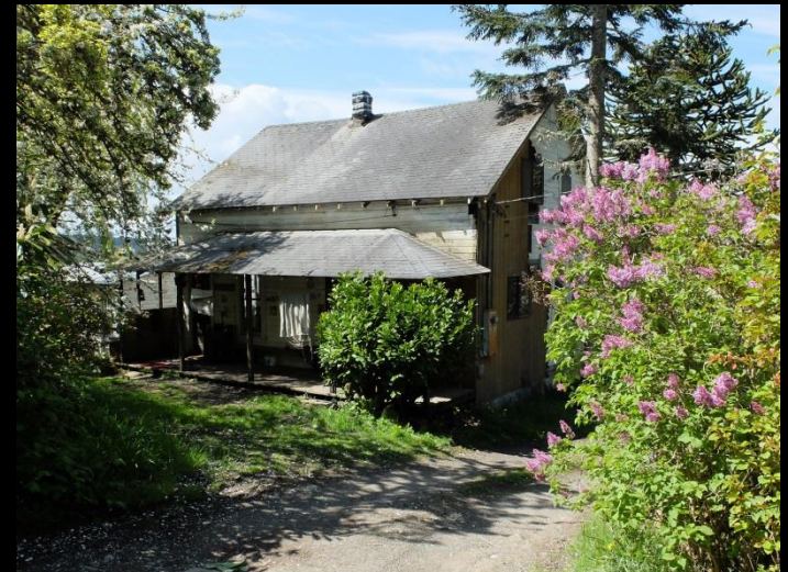
Suyematsu Farm, Bainbridge Island – 1928