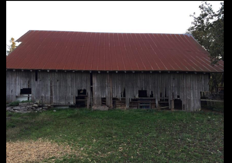
Tighe Mounts Farm, Rochester – 1913