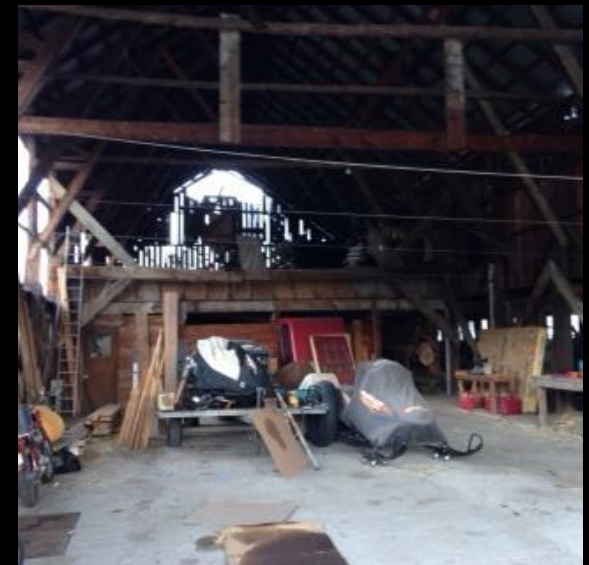
Patterson Mountain Ranch, Winthrop – 1930